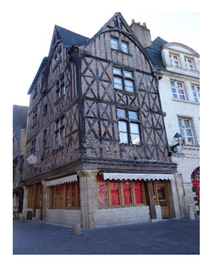
Figure 2. The ancient inn Les Trois Rois today, on the corner between Place Plumereau and Rue du change.

- 20 inn's and hotels' names: Trois Rois (au faubourg de Notre-Dame-la-Riche); Trois Rois (rue du change); St. Jean; Notre Dame; Liond'Or; La Chièvre; Trois Barbeaux; St. Christophe; Epine Fleurie; St. Catherine; La Serpe; la Tête-d'Or; La Grille; La Pomme-de-Pin; Mouton-d'Or; St. Marthe; Le Coq et La Pie; hostel du Tresteau; St. Georges; Cœur Navré.