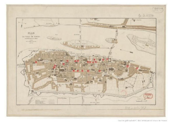
Figure 5. Localization of the inns (red).