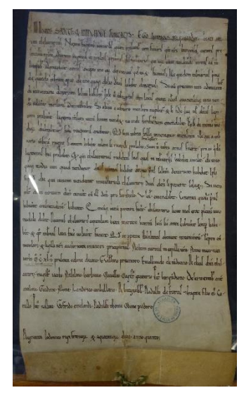
Figure 1. Parchment, Latin, 1141 (AMT, AA 1).

1) The initial phase entailed the analysis of a sample of documents from the middle of the 15th to the beginning of 16th century. The crosschecking information of both public and private sources highlighted the great relevance that the hospitality sector acquired in the economic and social life of the city. Evidence of that comes for example from a scroll in Latin of 1141, written by Henri, treasurer of the Chapter of St. Martin church. The last imposed duty on the retail sail of wine in Châteauneuf (a portion of the town). The document shows the role of the inn-keeper as a public officer.