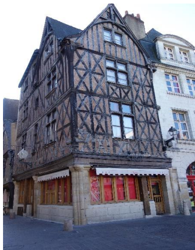
Figure 2. The ancient inn Les Trois Rois today, on the corner between Place Plumereau and Rue du change .

- 20 inn's and hotels' names: Trois Rois (au faubourg de Notre-Dame-la-Riche); Trois Rois (rue du change); St. Jean ; Notre Dame ; Lion-d'Or ; La Chièvre ; Trois Barbeaux ; St. Christophe ; Epine Fleurie ; St. Catherine ; La Serpe ; la Tête-d'Or ; La Grille ; La Pomme-de-Pin ; Mouton-d'Or ; St. Marthe ; Le Coq et La Pie ; hostel du Tresteau ; St. Georges ; Cœur Navré .