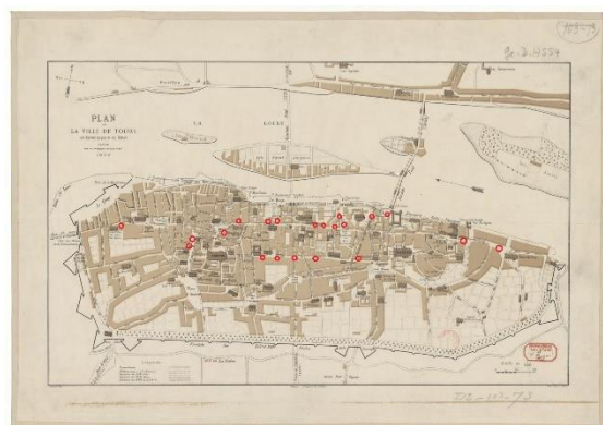
Figure 5. Localization of the inns (red).