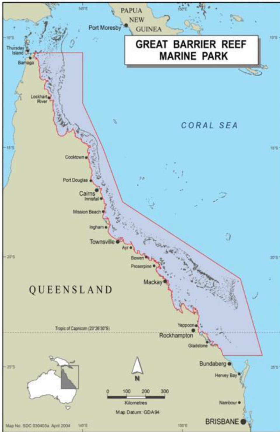
Fig. 1. The Great Barrier Reef Marine Park, Queensland Australia.

large difference in reef-associated expenditure estimates from Spalding et al. (2017) ($2.2 billion in 2013 US$) and Deloitte Access Economics (2013) ($481 million in 2012 AU$) demonstrates that the methodology for determining the economic contribution of coral reefs is still developing.