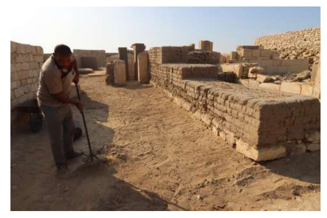
Figure 10: Levelling of the ground around the structures for proper drainage and the recovery of the stone wall basement.