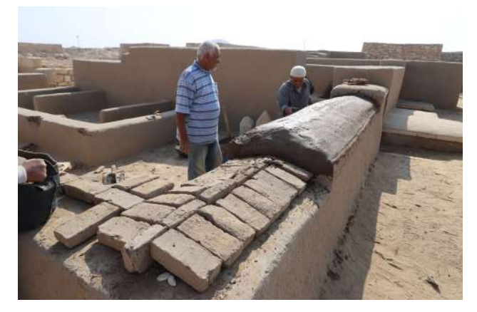
Figure 9: Rounded shape forming the protective capping prepared with bricks and two coats of plaster finish.

To keep the changes reasonable in aesthetic terms, the first experimental capping that was realized at the site was limited in height, and to make the process quick and easy, the shape was designed to be obtained simply by laying bricks on the edge and by modelling plastic mortar. The finish is obtained with two coats of plaster, the final one being flush with the plaster layer of the wall faces (Fig. 9).