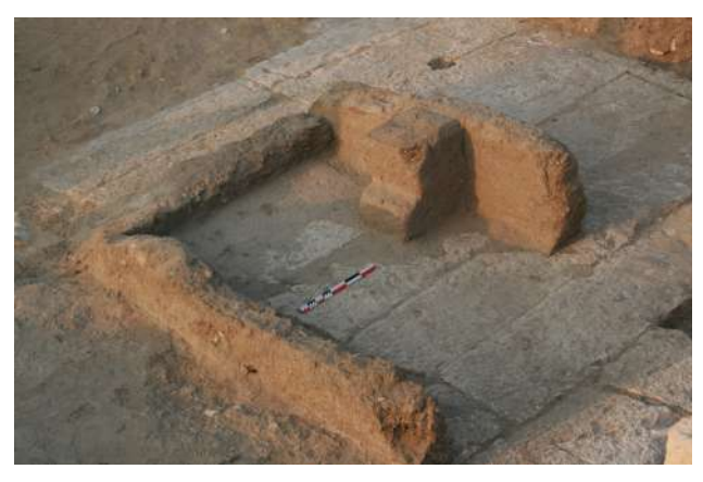
Figure 3: Queen Behenou 's complex: small mudbrick building discovered north of the pyramid. Construction of one to two bricks thick covered in places with a gypsum coating.

5. These elements, locally called zalat , come from the underlying natural terrain in the form of more or less thick terraces covering the limestone.