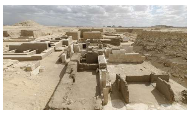
Figure 2: Funerary complex of Queen Mehaa and her son Hornetjerikhet (right), and the anonymous "Pyramide de l'Ouest" (left); use of massive brick walls and mixed constructions.

tures faced with limestone. To illustrate these cases, we can cite as examples the complex of Queen Méhaa and her son Prince Hornetjerikhet (Fig. 2) and Tomb No. 2 (excavated in 2022), the main parts of which are made of bricks, with the outer walls covered with limestone "slabs".