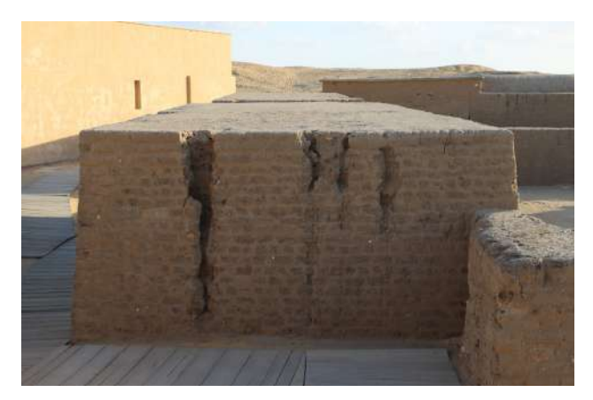
Figure 8: Gullies formed on a recently partially reconstructed entry pylon of one of the tombs of the New Kingdom necropolis at Saqqara.

fallen directly on the ground and has not been absorbed. Additionally, there is the potential presence of runoffs from the nearby environment. Almost always at archeological sites, the presence of debris pits all around tends to create "funnel effects", that often result in "swimming pool effects". In such circumstances, wall bases become humid and lose their bearing capacity, resulting in the leaning out of the structures and further collapse, thin walls being more quickly affected than thick ones. At the Pepy I necropolis, two factors aggravate this process. The first of these is that some of the courtyard floors are paved with stones, with little capacity to absorb water, though it should be noted that around the main pyramid, the original pattern of the stone paved floor is that it had been levelled to ensure drainage towards exits and drainage pits. The second aggravating factor is the presence of sand deposits (brought by wind) that keep the humidity high, and thus also keep the walls wet.