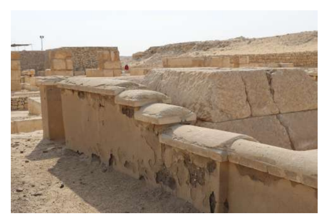
Figure 6: The conservation works (method C) did not prove efficient during the 2020 rains. {}^{\circ} T. Joffroy

Critical observation of the listed methods: advantages and disadvantages.