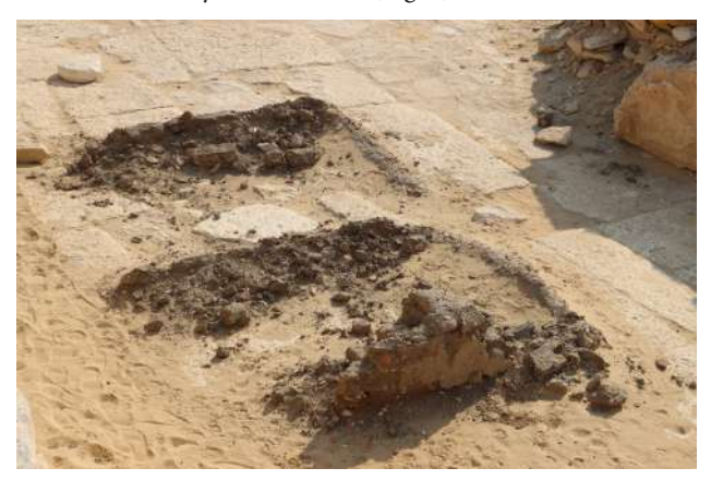
Figure 7: The small structure (see Figure 4) built right above stone slabs suffered badly in 2020.

At the bases of the walls: erosion in the form of "destructive furrows" exists in zones prone to runoff and / or water stagnation. These instances of erosion are very important where damp is retained by sand or powdery earth deposits on the surrounding ground. Wall (and floor) configurations on stone slabs are also very unfavourable (Fig. 7).