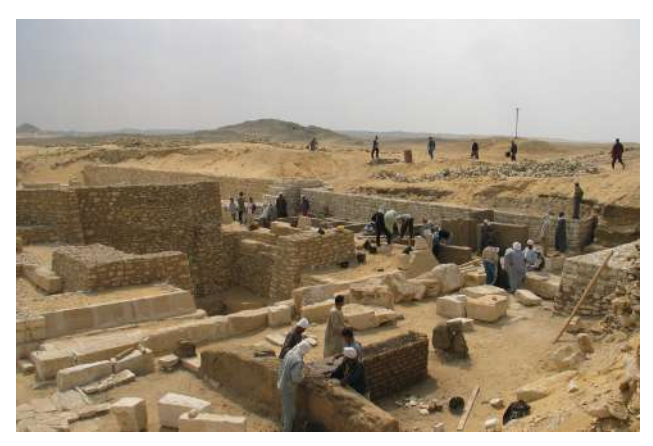
Figure 5: Conservation works on the mudbrick structures (methods A and B).

Method C: covering the wall levels in order to protect the tops of the walls with "caps"; first, the structures are completed in order to create a rectilinear top with bricks (method A); when the wall is several rows thick, only the outer courses are rebuilt while those constituting the core are replaced with a filling (fragments of limestone, bricks and earth combined). Finally, the "caps", made with modern fired bricks bound with lime mortar, are mounted in an overhanging position, and covered by a semi cylindrical shape made from the same mortar mentioned above.