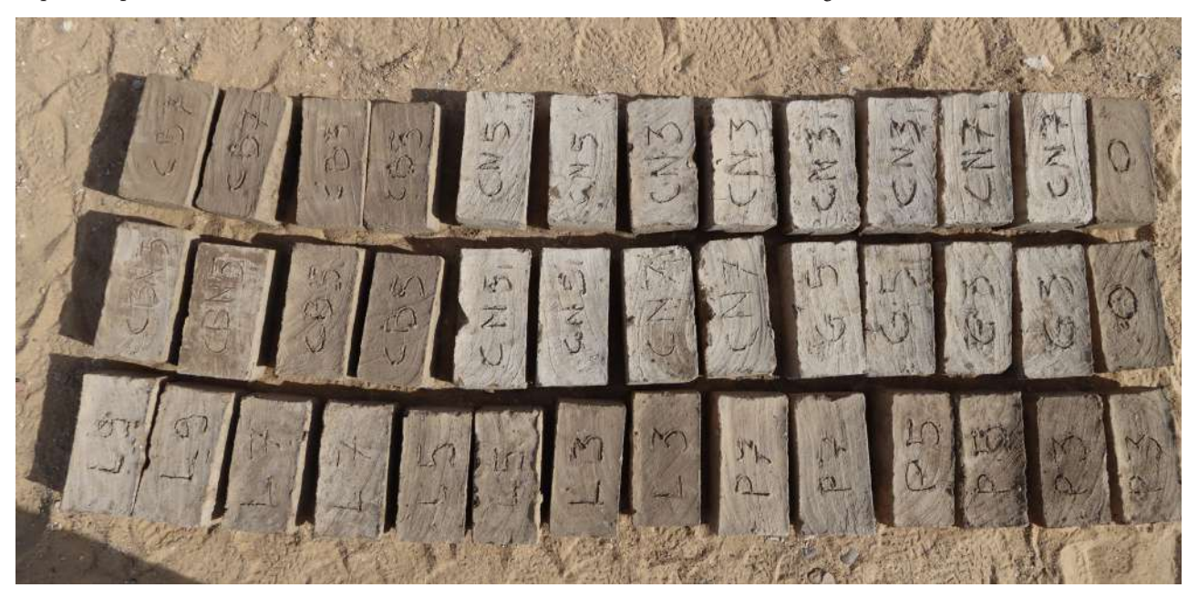
Figure 11: Samples of bricks prepared using a variety of stabilizers and dosages.

The sample restoration works implemented to date have already received substantial amounts of rainfall. Their behavior has been quite good; however, as the rains were not at the level observed in 2020, it is too early to assess the advantages and the limits of these solutions. Additional experiments are planned, but more work will need to be implemented in the future to draw conclusions and possibly extend applications. To that end, there is a definite need to find a proper balance between technical efficiency and the desired aspects of the remains brought to light. This will require strong collaboration between the archaeologists and the conservators involved, in