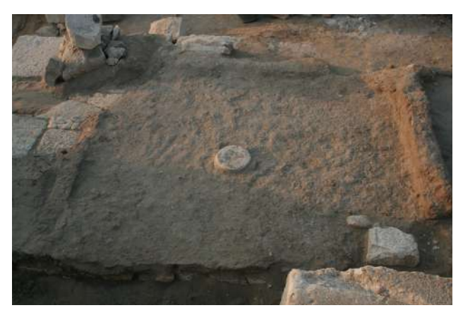
Figure 4: Queen Behenou 's complex: small mudbrick building erected in the courtyard north of the pyramid. An earthen floor was laid on a pre-existing pavement.