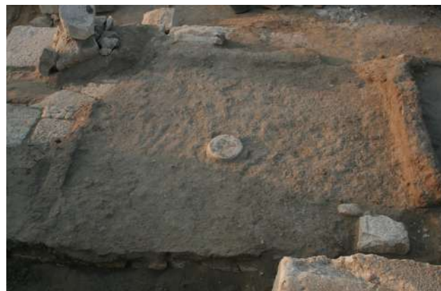
Figure 4: Queen Behenou 's complex: small mudbrick building erected in the courtyard north of the pyramid. An earthen floor was laid on a pre-existing pavement.