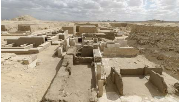
Figure 2: Funerary complex of Queen Méhaa and her son Hornetjerikhet (right), and the anonymous “Pyramide de l'Ouest” (left); use of massive brick walls and mixed constructions.

tures faced with limestone. To illustrate these cases, we can cite as examples the complex of Queen Méhaa and her son Prince Hornetjerikhet (Fig. 2) and Tomb No. 2 (excavated in 2022), the main parts of which are made of bricks, with the outer walls covered with limestone “slabs”.