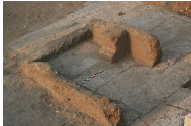
Figure 3: Queen Behenou 's complex: small mudbrick building discovered north of the pyramid. Construction of one to two bricks thick covered in places with a gypsum coating.