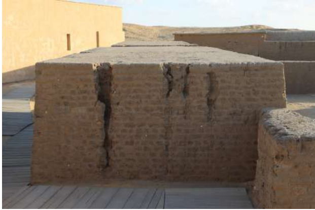
Figure 8: Gullies formed on a recently partially reconstructed entry pylon of one of the tombs of the New Kingdom necropolis at Saqqara.