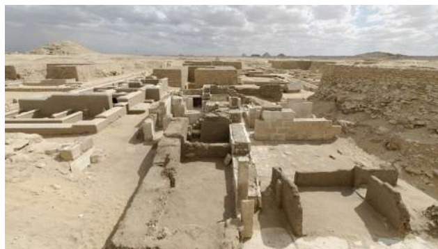
Figure 2: Funerary complex of Queen Méhaa and her son Hornetjerikhet (right), and the anonymous “Pyramide de l'Ouest” (left); use of massive brick walls and mixed constructions.

tures faced with limestone. To illustrate these cases, we can cite as examples the complex of Queen Méhaa and her son Prince Hornetjerikhet (Fig. 2) and Tomb No. 2 (excavated in 2022), the main parts of which are made of bricks, with the outer walls covered with limestone “slabs”.