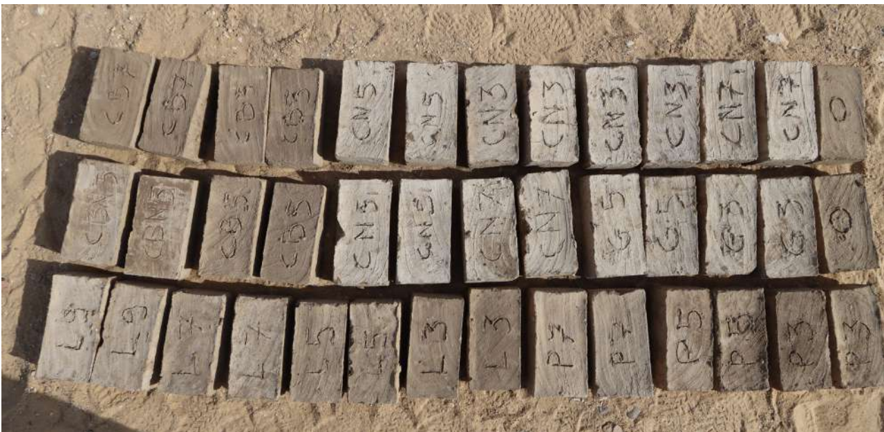
Figure 11: Samples of bricks prepared using a variety of stabilizers and dosages.

The sample restoration works implemented to date have already received substantial amounts of rainfall. Their behavior has been quite good; however, as the rains were not at the level observed in 2020, it is too early to assess the advantages and the limits of these solutions. Additional experiments are planned, but more work will need to be implemented in the future to draw conclusions and possibly extend applications. To that end, there is a definite need to find a proper balance between technical efficiency and the desired aspects of the remains brought to light. This will require strong collaboration between the archaeologists and the conservators involved, in