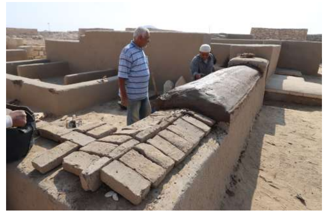
Figure 9: Rounded shape forming the protective capping prepared with bricks and two coats of plaster finish.

To keep the changes reasonable in aesthetic terms, the first experimental capping that was realized at the site was limited in height, and to make the process quick and easy, the shape was designed to be obtained simply by laying bricks on the edge and by modelling plastic mortar. The finish is obtained with two coats of plaster, the final one being flush with the plaster layer of the wall faces (Fig. 9).