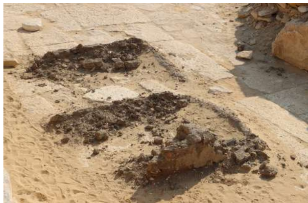
Figure 7: The small structure (see Figure 4) built right above stone slabs suffered badly in 2020.

At the bases of the walls: erosion in the form of “destructive furrows” exists in zones prone to runoff and / or water stagnation. These instances of erosion are very important where damp is retained by sand or powdery earth deposits on the surrounding ground. Wall (and floor) configurations on stone slabs are also very unfavourable (Fig. 7).