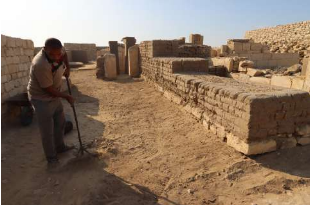
Figure 10: Levelling of the ground around the structures for proper drainage and the recovery of the stone wall basement.