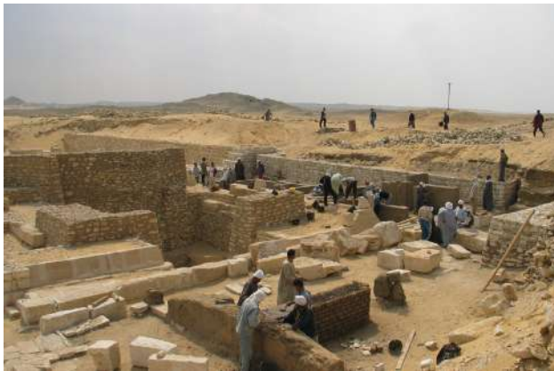
Figure 5: Conservation works on the mudbrick structures (methods A and B).

Method C: covering the wall levels in order to protect the tops of the walls with “caps”; first, the structures are completed in order to create a rectilinear top with bricks (method A); when the wall is several rows thick, only the outer courses are rebuilt while those constituting the core are replaced with a filling (fragments of limestone, bricks and earth combined). Finally, the “caps”, made with modern fired bricks bound with lime mortar, are mounted in an overhanging position, and covered by a semi cylindrical shape made from the same mortar mentioned above.