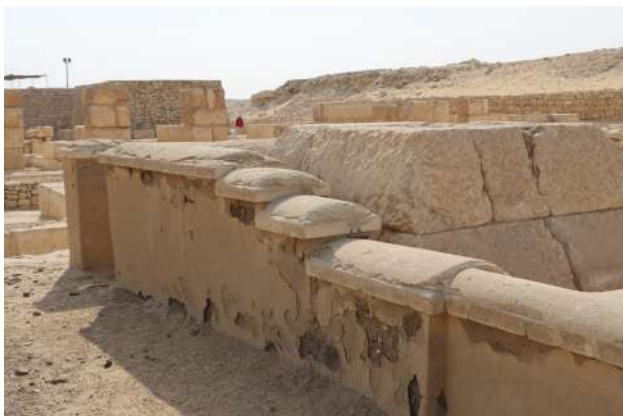
Figure 6: The conservation works (method C) did not prove efficient during the 2020 rains.