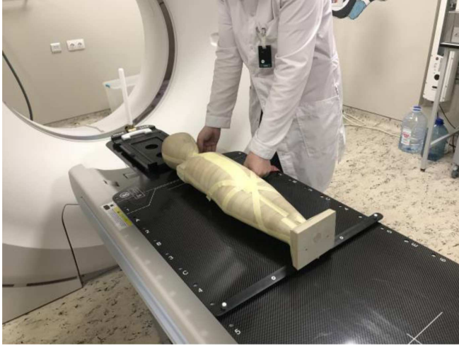
Fig. 2. Validation of the simulation framework with phantom measurements.

Further research will be aimed at improving the simulation speed of out-of-field dose computations in PRIMO, as well as expanding PRIMO capabilities to include proton beams. Research is also being conducted in the direction of improving the analytical models used for the computation of the out-of-field dose in photon [59] and proton treatments.