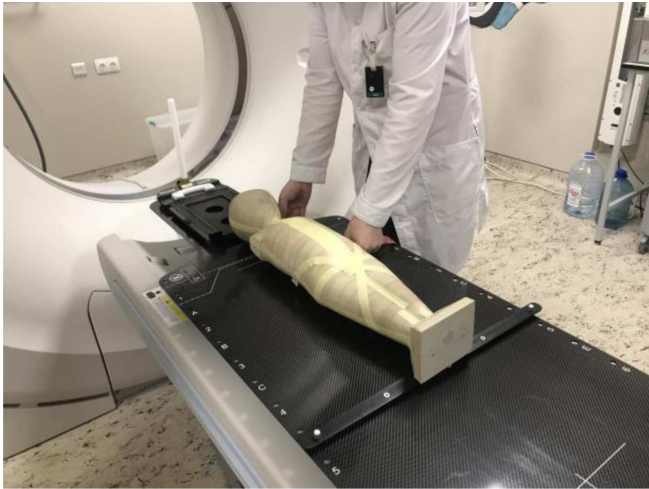
Fig. 2. Validation of the simulation framework with phantom measurements.

Further research will be aimed at improving the simulation speed of out-of-field dose computations in PRIMO, as well as expanding PRIMO capabilities to include proton beams. Research is also being conducted in the direction of improving the analytical models used for the computation of the out-of-field dose in photon [59] and proton treatments.