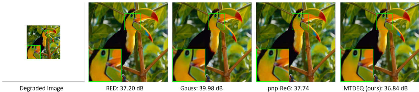
Fig. 2. Image-comparisons with RED [7], pnp-ADMM with the Gaussian denoiser from [5] (Gauss), pnp-ReG [8], and pnp-ADMM with the prior obtained via MTDEQ; results are reported in PSNR.

resolution on a image that is degraded using a Gaussian kernel (with \sigma_{\text{blur}} = 0.5 ). The results can be seen in Tables I and II and the visual results can be observed in Fig. 2. The pnp-ADMM is the closest comparison to our MTDEQ-prior, since it uses the same algorithm in testing, only with a Gaussian denoiser as prior.