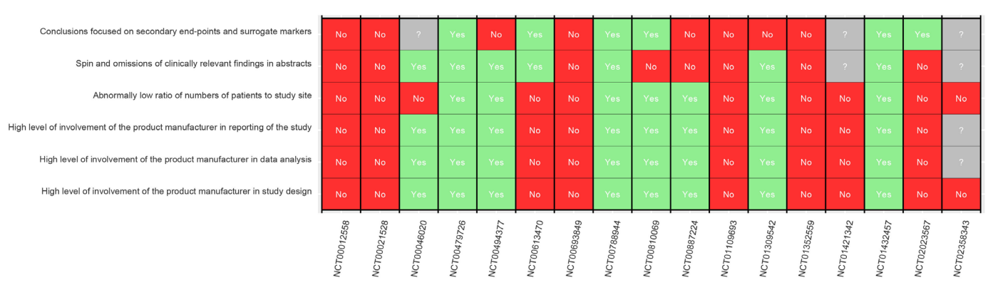
Figure 2 Seeding trial characteristics (yes/no) for all published trials.