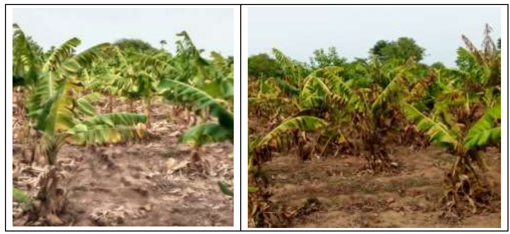
Figure 3. Banana leaves drying and yellowing after scorching temperatures in April 2023

The table shows that 79.77% of growers consider loss of production to be a medium problem, while 27.91% consider it to be a high problem. The loss of banana plantations is due to the rise in temperature, which causes the drying and yellowing of the banana leaves (Figure 3).