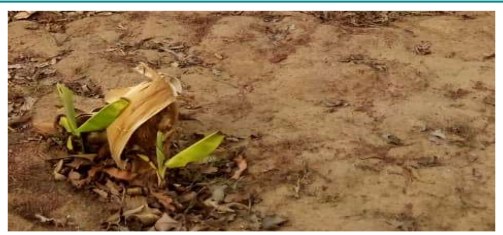
Figure 4. Banana plants dying due to water stress caused by rising temperatures

This leads to lost bananas and therefore reduced productivity. Similarly, 72.72% of respondents had noted a reduction in the size of their plots, but considered this to be a medium problem. On the other hand, the reduction in income, the increase in banana diseases, the reduction in banana quality and the loss of banana plants were considered to be minor problems by producers.