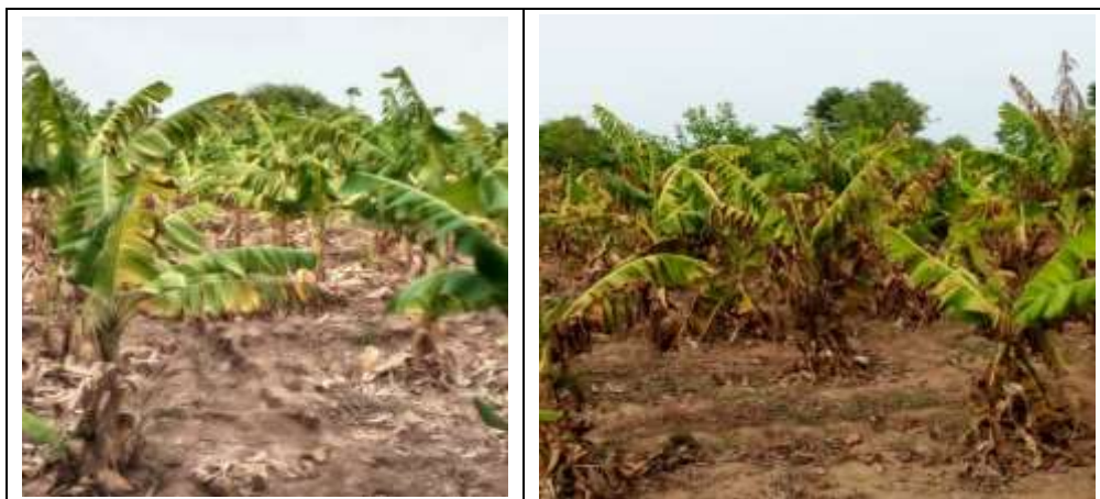
Figure 3. Banana leaves drying and yellowing after scorching temperatures in April 2023

The table shows that 79.77% of growers consider loss of production to be a medium problem, while 27.91% consider it to be a high problem. The loss of banana plantations is due to the rise in temperature, which causes the drying and yellowing of the banana leaves (Figure 3).