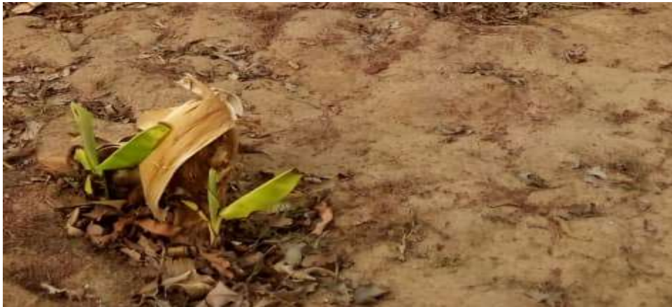
Figure 4. Banana plants dying due to water stress caused by rising temperatures

This leads to lost bananas and therefore reduced productivity. Similarly, 72.72% of respondents had noted a reduction in the size of their plots, but considered this to be a medium problem. On the other hand, the reduction in income, the increase in banana diseases, the reduction in banana quality and the loss of banana plants were considered to be minor problems by producers.