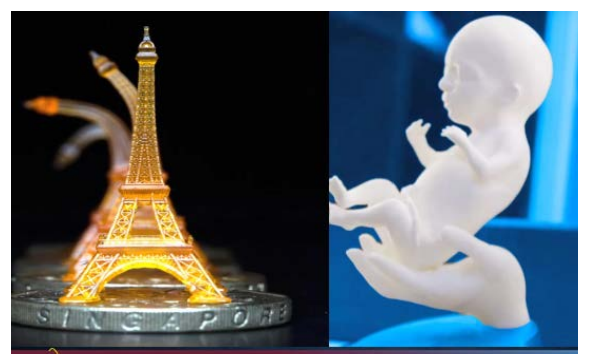
Fig. 1. 4D additive manufacturing cases

structure before forces that push its layers in a direction opposite to the direction of printing. Another limitation is that once printed the product will remain with its initial geometric and mechanical properties throughout its useful life, making it a static and structurally unchanging product, which limits its use in certain scenarios that demand a change in its form.