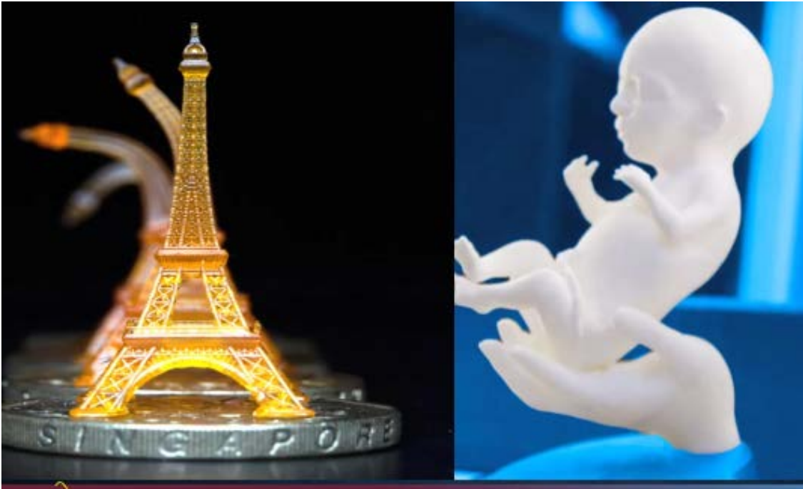
Fig. 1. 4D additive manufacturing cases

structure before forces that push its layers in a direction opposite to the direction of printing. Another limitation is that once printed the product will remain with its initial geometric and mechanical properties throughout its useful life, making it a static and structurally unchanging product, which limits its use in certain scenarios that demand a change in its form.