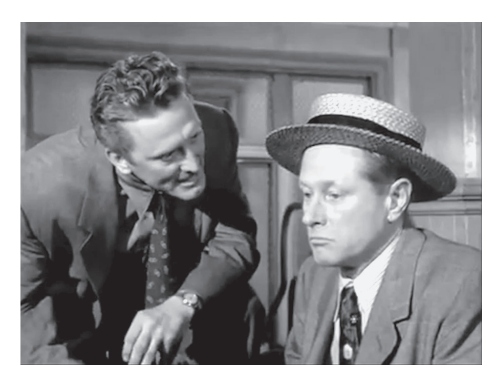
Figure 4.4 Hemming in the characters (Detective Story, 1951)

Wyler constantly makes the tight spaces even tighter through framing. Interrogations are regularly carried out with the detective crowding the space of their suspects and the camera following suit. In one shot, three policemen and the criminal, who they manage to "turn" informant, are bunched into a single frame (Figure 4.5). The suspect is surrounded by the cops, within both the set and the frame. He is seated on the bench against a wall with a policeman siting on either side. The third cop is standing in front of him blocking the possibility of his bursting from his seat. The camera itself closes any visual breathing space (or escape route) as the four people can barely stay within the