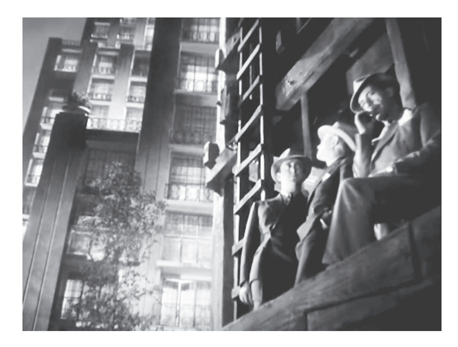
Figure 4.2 The ominous nature of an extremely low angle (Dead End, 1937)