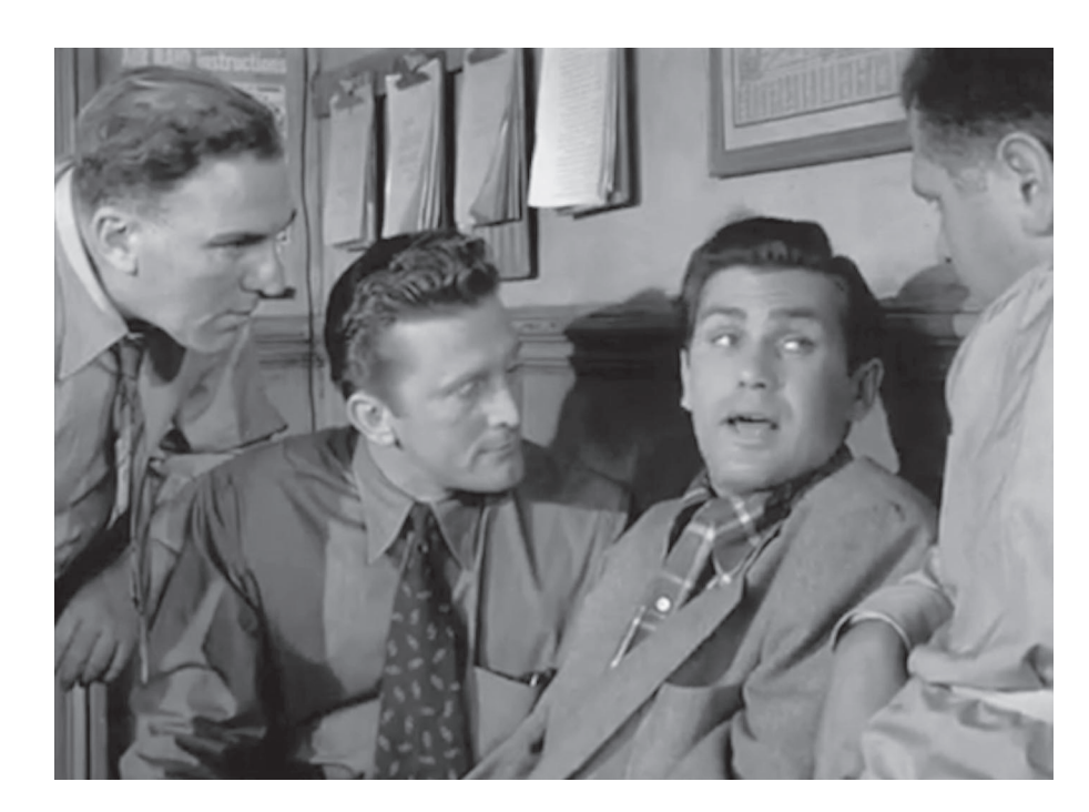
Figure 4.5 Hemming in the suspect (Detective Story, 1951)

shot. The standing policeman has to bend forward, pushing even further into the suspect's space. When the suspect does turn, the camera suddenly pulls back to show the room. The characters of this sequence then leave the precinct, allowing the camera to close in on another case. Throughout the film, the camera remains at eye level, placing audience and characters on an equal footing. That is until James McLeod finds out about his wife's (Eleanor Parker) past. Then the image vacillates between high and low angles. McLeod's life and certainties visually lose balance.