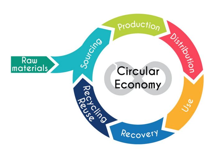
Fig. 1 Illustration of the concept of circular economy

The coating industry has transformed rapidly in recent years. One of the reasons for this is the urgent need to reduce GHG and VOC emissions, which affect human health and contribute to the climate crisis. In addition, there are bottom-up movements emanating from the population to make healthier coatings from biobased sources as well as difficulties securing supplies due to the pandemic and obtaining specific chemical structures from petrochemical sources. While these reasons certainly encourage the coating industry to transition towards greener, safer, and more locally sourced coating solutions, implementing new regulations remains one of the most effective ways to transform the industry. Such regulations are necessary to ensure that the ambitious GHG emission reduction targets are met [3].