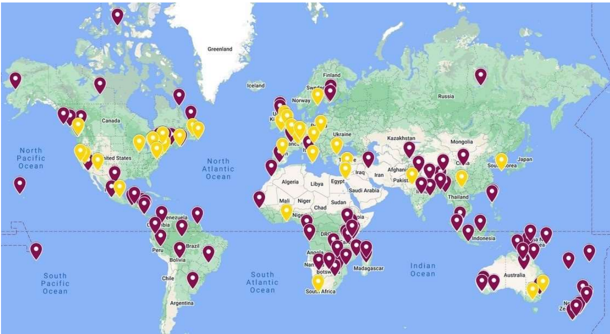
Fig 1. Spatial representation of the publications reviewed for this article (a total of 166 titles listed in Annex; the reference list provided in the article's Bibliography section (90 titles) is a summary of the most key, instrumental, and recent sources that have had the major role in shaping the paper). Those in purple (106 titles) correspond to IPLC site-based studies and the remaining 60 titles in yellow correspond to non-IPLC site-based studies that nevertheless focused on territories of life (e.g. global reports, policy publications, etc.).