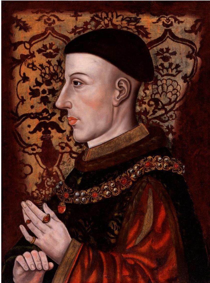
Figure 1 - Portrait of Henry V

Anonymous – Oil on Panel late sixteenth – early seventeenth century Dim/: 724mm x 410mm National Portrait Gallery NPG 545, Transferred from the British Museum, 1879