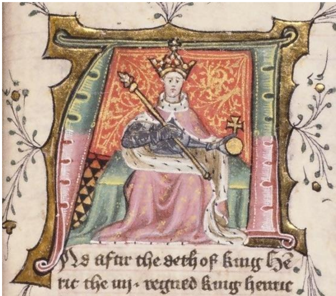
Figure 9 - Henry V Enthroned