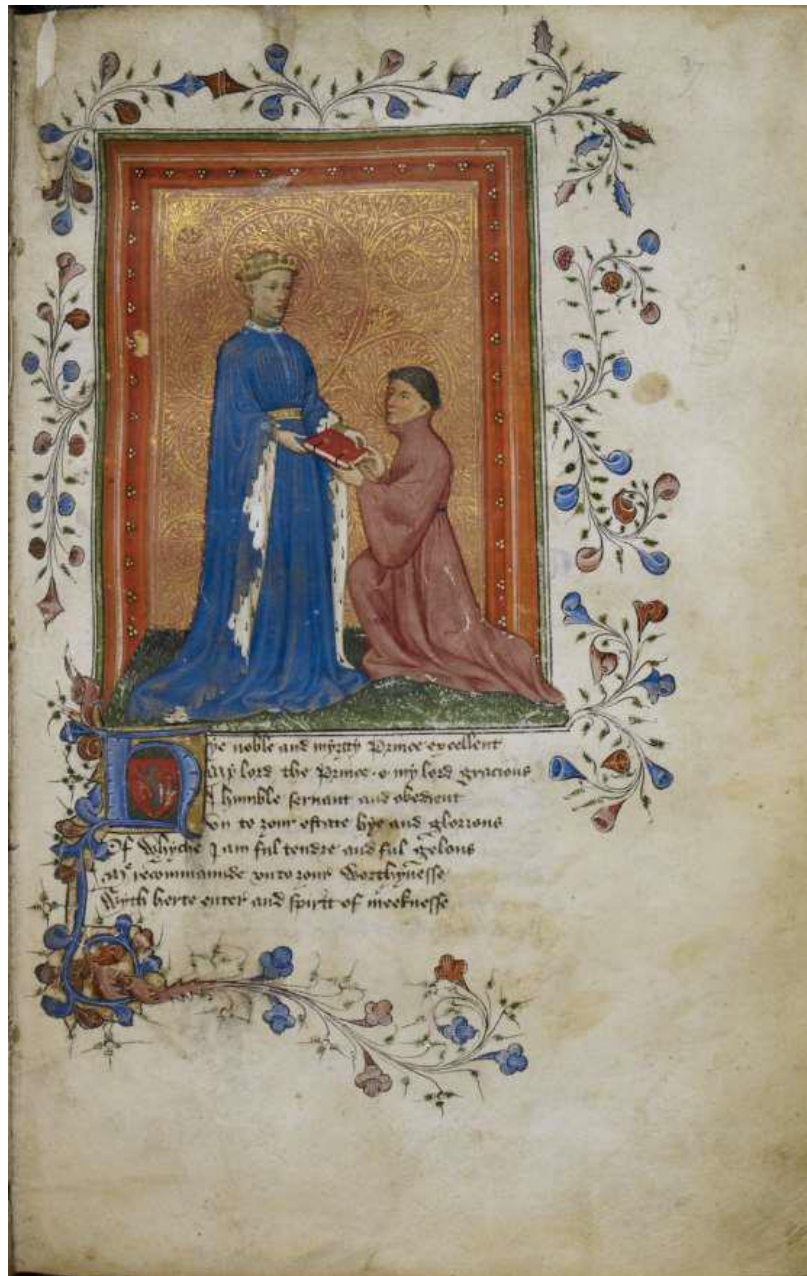
*Figure 7 - Prince Henry receiving (or giving) the book

Workshop of Herman Scheerre – Parchment Codex