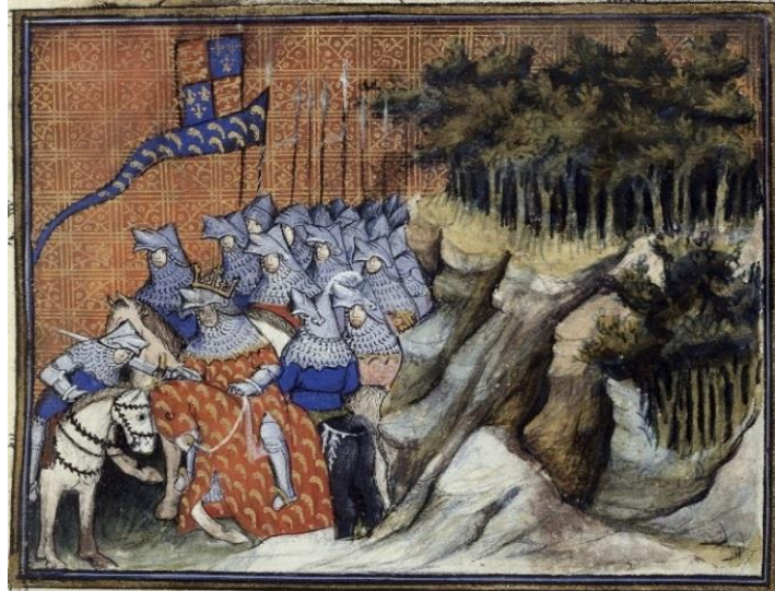
*Figure 3 - Henry Bolingbroke Seizes the Throne