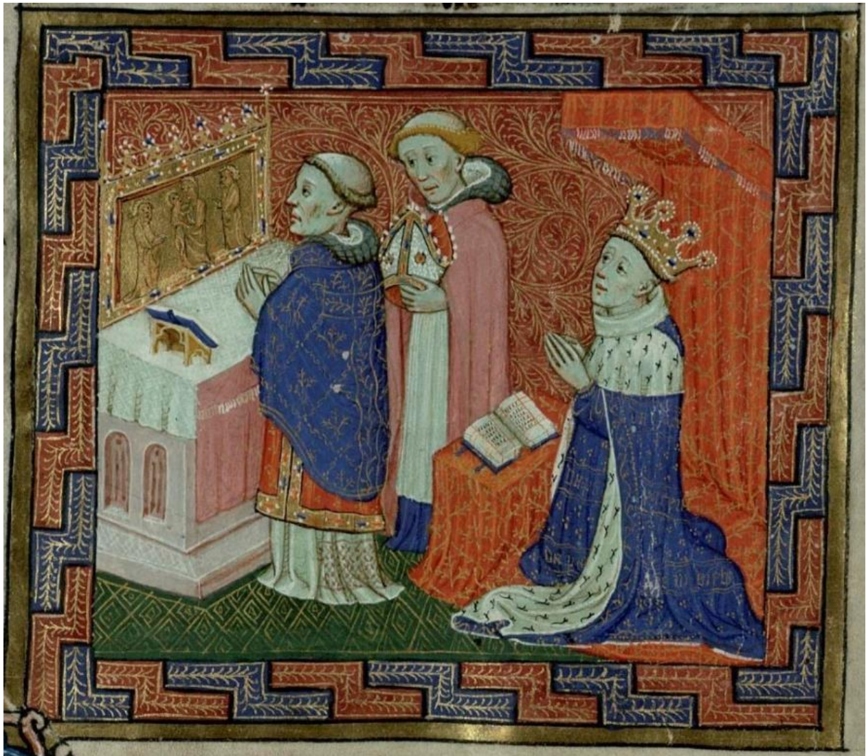
Figure 4 - Henry V Kneeling at Mass

The Cornwall Master (?) Parchment c. 1420