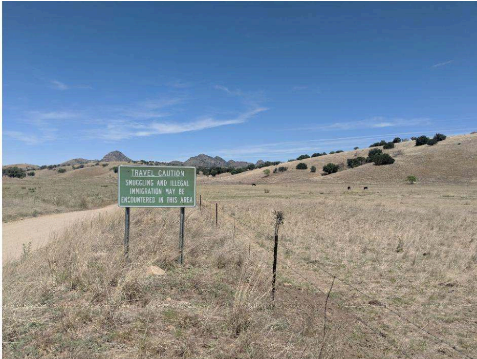
Figure 2: States can sometimes even directly acknowledge their incomplete control of sparsely populated areas...

some point to get to their destination. In sum, it is easier to take the effort to control out of sparsely populated areas, where it is almost impossible, in order to exert it in areas closer to the cities, where the exertion of power is easier. Such limits of technological control of difficult areas were also proven time and again in Afghanistan, where the Mujahidin and then the Taliban could hold out against two superpowers in great part because of the nature of the terrain.