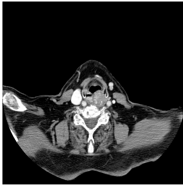
Figure 3. CT scan of a patient with a laryngeal well-differentiated liposarcoma.

Kaposi's sarcoma is an extremely rare HIV-associated neoplasm. The largest series across the literature corresponds to Mochloulis et al., including 17 patients with laryngeal Kaposi's sarcoma. In this series, the supraglottic location was the most common, and the main treatment strategy was conservative; more specifically, five patients were treated with low-dose radiotherapy and ten were treated with systemic chemotherapy for disseminated Kaposi's sarcoma. According to the authors, laryngeal Kaposi's sarcoma did not contribute to patient mortality [74]. More recently, treatment strategies using intralésional bevacizumab have also been reported as a possible treatment for localized mucosal lesions [75].