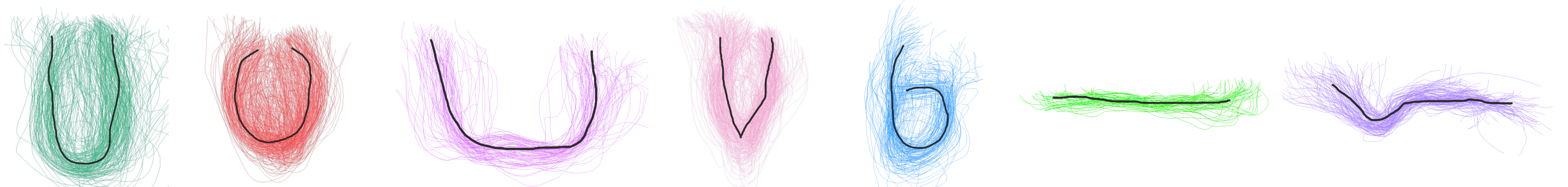
Figure 1 : Different shapes of short-range connections found in the superficial white matter (SWM) atlases developed by [ref] : U-shaped, C-shaped, open U-shaped, V-shaped, 6-shaped, straight and curved.

Although less studied than long-range connections, superficial white matter has been linked with neurodegeneration during ageing as well as to neurodegenerative diseases like Alzheimer's disease [1]. Most of the studies about short-range connections use small cohorts and a very small number of short-range bundles because the available white matter bundles atlases contain mainly large connections and the tools used to study them are adapted for long connections . Here, we optimize the RecoBundles method [3] for automated recognition of short fibers found in the short-range atlases developed by [4]. For each bundle in the atlas, this new method finds geometrical parameters describing the bundle and uses them to extract the bundle in a subject's tractogram. Hence, this method can be applied to big databases and different atlases with little parameter tuning.