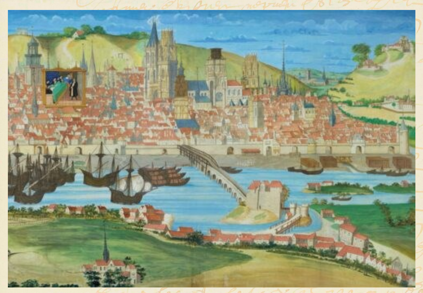
Rouen in 1525 with sea ships and river boats either side of the main bridge, digitised by Rotomagus

For northern France, Rouen was a vital port. It was not only an important city in its own right, it also served as a gateway for Paris. It was here that goods were transferred from seafaring ships onto smaller crafts that made their way further inland. But Rouen was already some way from the open seas and boats had to snake their way up the Seine to the city, navigating twists and turns and treacherous sandbanks.