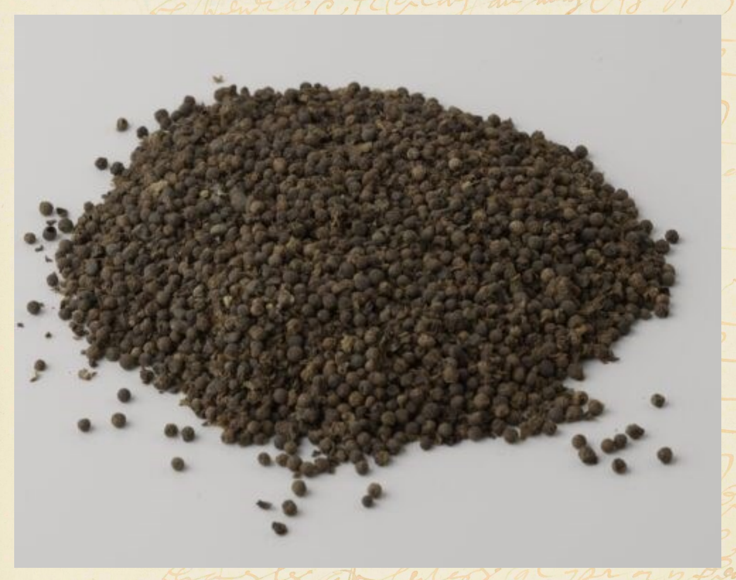
Pepper from the wreck of another the Dutch ship, before 1613, preserved in the Rijksmuseum.

Pepper was far more water resistant and unlikely to simply dissolve as had the sugar. The presence in the Rijksmuseum in Amsterdam of around 700g of peppercorns retrieved from the wreck of the 'Witte Leeuw' or White Lion, that sunk before 1613, stands testament to its ability to survive water damage.