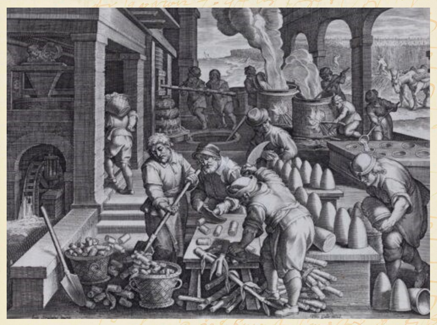
The making of sugar loaves, circa 1580— a drawing by Jan van der Straet engraved by Philips Galle – digitised by the <u>British Museum</u>.

Before being shipped, it was transformed into sugar loaves that were then put into bales or barrels for the sea journey. The Gold Falcon had one such barrel, described as a 'boucault', a very light white wooden barrel. With hindsight, using a relatively flimsy contraption may have been a mistake. The sugar was described as having "completely melted away, with nothing left but pieces of woods, cords, straw and paper" that had been used to wrap it.