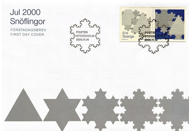
Figure 1. The limited-edition First Day Cover envelope printed by the Swedish Post Office on November 16, 2000, featuring the snowflake curve.

Mandelbrot said that von Koch's curve was an inspiration to him throughout his life. In his masterpiece The Fractal Geometry of Nature , he devotes an entire chapter to it and cites it no less than 200 times (see [13]). Because of their different fractal properties he was the first to clearly distinguish between the original curve, the snowflake curve and the filled snowflake. Three different fractal sets, all by one man: von Koch. Mandelbrot did not invent the snowflake. If that were the case he would have made it known. Moreover, he finds the name inappropriate, preferring 'Koch Island', largely because he originally used von Koch's curve as a model for coastlines. This gives us an idea: What if the snowflake curve was born under a different name?