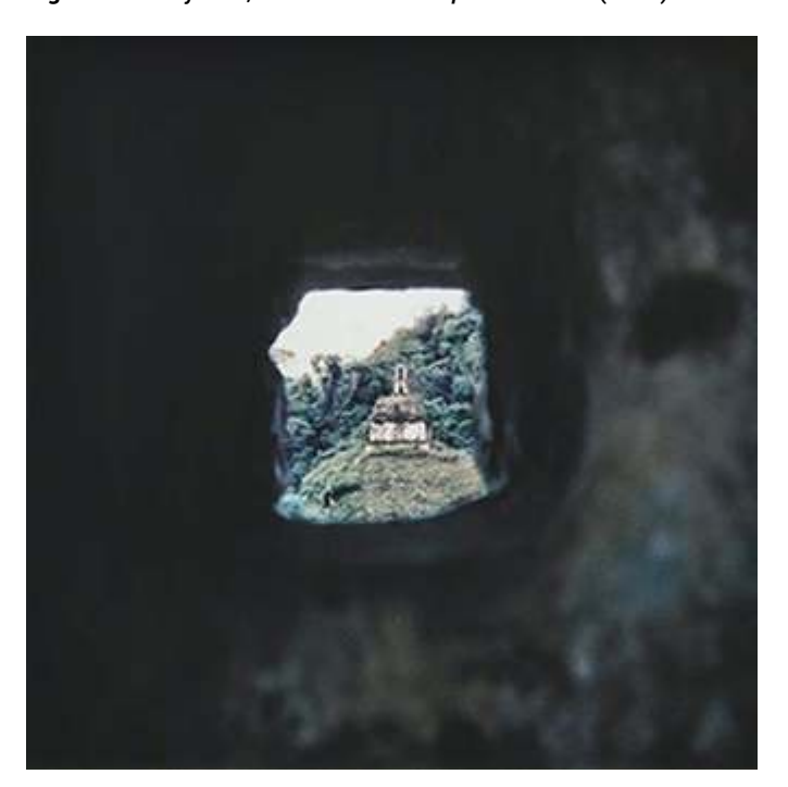
Figure 2. Nancy Holt, Ruin View: the Temple of the Sun (1969)

Copyright: Art © Holt/Smithson Foundation/ADAGP, Paris, 2023.