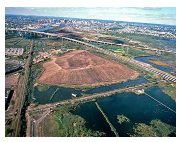
\label{lem:copyright:art @ Holt/Smithson Foundation/ADAGP, Paris, 2023. \ https://holtsmithsonfoundation.org/sky-mound

The park that she wanted to build was meant to be divided into a solar and a lunar area, with gravel paths in alignment with the solstices, ten mounds, a large sphere encircled by a moat to represent the moon, torches visible from the planes overhead and fueled by gases recovered from the tons of garbage below, and a pond attracting wildlife and draining water from the landfill. (Figure 5)