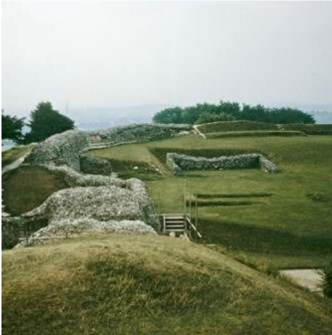
Figure 1. Nancy Holt, Old Sarum (1969)

Copyright : Art © Holt/Smithson Foundation/ADAGP, Paris, 2023. https://media.tate.org.uk/aztate-prd-ew-dg-wgtail-st1-ctr-data/images/old-sarum-nachy-holt_0.width-840.jpg