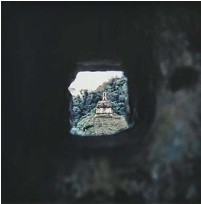
Figure 2. Nancy Holt, Ruin View: the Temple of the Sun (1969)

Copyright: Art © Holt/Smithson Foundation/ADAGP, Paris, 2023.