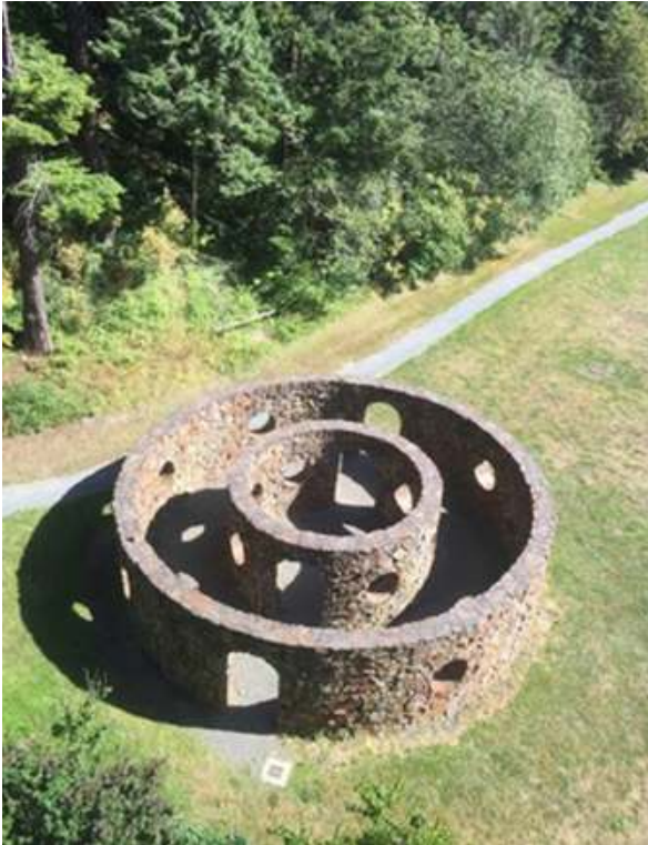
Figure 3. Nancy Holt, Stone Enclosure. Rock Rings (1977-1978)

https://holtsmithsonfoundation.org/stone-enclosure-rock-rings