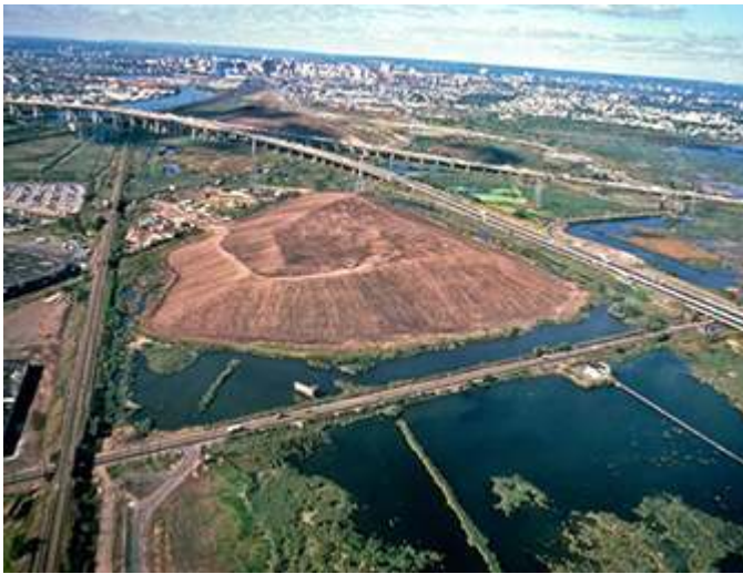
Figure 4. Aerial view of the original Sky Mound site (1984)

Copyright : Art © Holt/Smithson Foundation/ADAGP, Paris, 2023. https://holtsmithsonfoundation.org/sky-mound