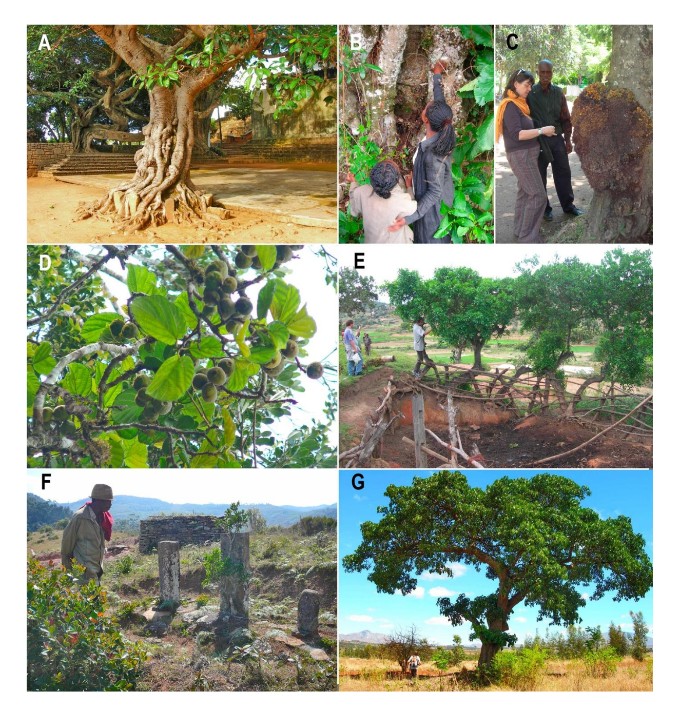
Figure 3. Different cultural aspects of Ficus on Madagascar. A ) F. lutea at the Rova Ambohimanga, Antananarivo, a tree of the 12 wives of the Merina King Andrianamipoimerina; B ) children collecting fruits F. botryoides , Fompoha , Fianarantsoa; C ) F. botryoides in the Botanical Garden of Tsimbazaza, Antananarivo, with Martine Hossaert-McKey collecting samples; D ) F. tiliifolia , local variety voara bekobo , literally "the voara with thick lips" due to the unusual protuberant aspect of the ostiole; E ) Finn Kjellberg collecting samples of F. reflexa planted by large cuttings around a zebu corral; F ) F. reflexa growing on a stele and Jean-Marie explaining the sacred nature of the stone and of the plant; and G ) isolated tree of F. lutea in agricultural lands, Ambohimahamasina, near Ambalavao.