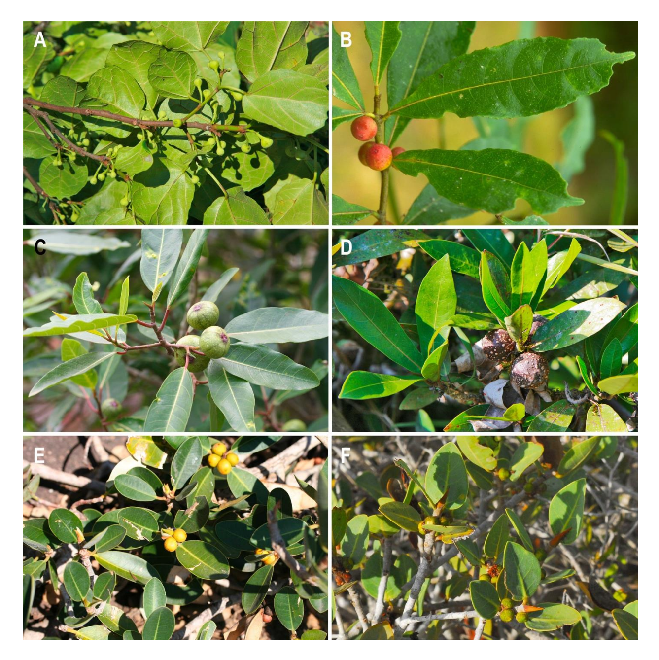
Figure 2. Malagasy Ficus. A) F. pachyclada, B) F. politoria, C) F. trichoclada, D) F. polyphlebia, E) F. menabensis, and F) F. humberti.