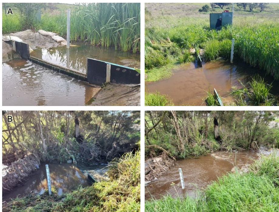
Figure 1: Quirks Creek flow monitoring weirs (A: downstream site; B: upstream site) showing low and high tailwater conditions.