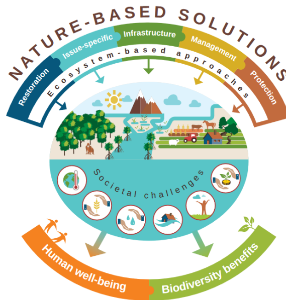
Figure 1. Nbs as an umbrella term for ecosystem-related approaches (from Cohen-Shacham et al. 2016)

The International Union for Conservation of Nature (IUCN), defines nature-based solutions (NBS) as “actions to protect, sustainably manage and restore natural or modified ecosystems, which address societal challenges (e.g. climate change, food and water security or natural disasters) effectively and adaptively, while simultaneously providing human well-being and biodiversity benefits” (Cohen-Shacham et al. 2016) (Figure 1). According to the European Commission, NBS are “Solutions that are inspired and supported by nature, which are cost-effective, simultaneously provide environmental, social and economic benefits and help build resilience. Such solutions bring more, and more diverse, nature and natural features and processes into cities, landscapes and seascapes, through locally adapted, resource-efficient and systemic interventions” (European Commission 2016). While IUCN definition seems restricting the concept of NBS to solutions powered by functioning ecosystems, the EU definition allows for solutions which are inspired and supported by nature; therefore, broadening the range of solutions from mainly functioning ecosystems (as per IUCN definition) to other solutions assisted by living systems. In addition, the term “inspired” could open up to solutions that not only utilize living systems, but are inspired by some natural principles or mechanisms.