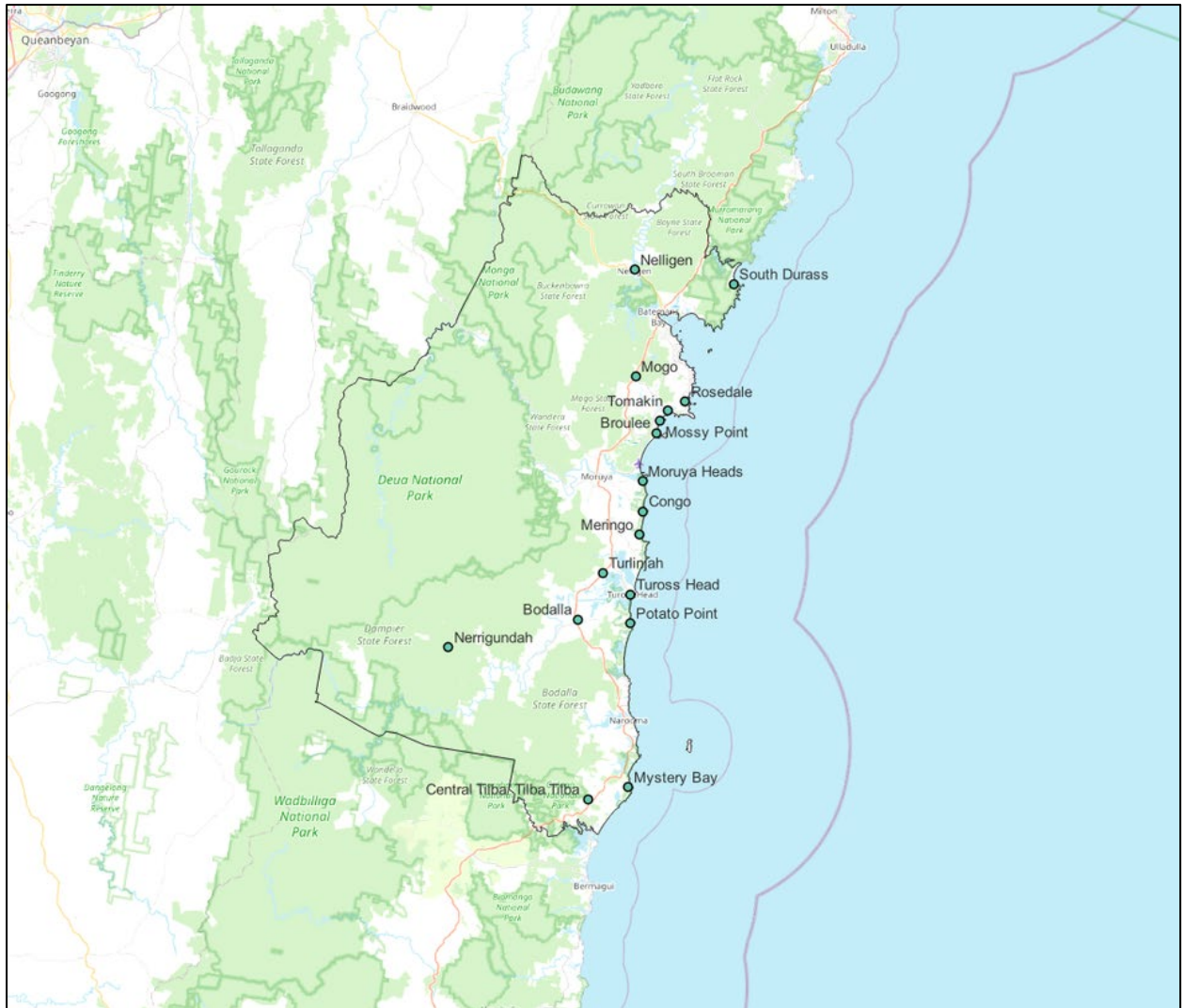
Figure 2: Map of the 18 sites in the Eurobodalla region. Map data from OpenStreetMap ( openstreetmap.org/copyright ).

In the quantitative assessment, the vastly different nature of the variables in the criteria (some demographic, distances, etc) were compared by normalising each criterion on a relative scale of 0 to 5. Scores of 5 represent the highest level of vulnerability or feasibility present across all sites, while scores of 0 were the lowest. The exception was the criterion of home occupancy rate which we considered to be so fundamental, we gave it twice the weighting with a score out of 10.