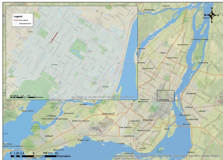
Figure 2: Overview of the study area of Montreal, Canada.

The research presented in this paper focuses on quantifying the benefits related to runoff volume reduction and CSO reduction. Real construction costs will be considered, and the maintenance costs will be estimated from an exhaustive survey. The study area comprised the Mount Royal and Lafontaine Park districts in Montreal, Canada (Figure 2). More specifically, Gilford Street, where new bioretention systems are currently being built, will be studied in more detail. Simulations with SWMM will be conducted for various scenarios, with and without SCMs, for the non-freezing season (May to October) with 10 years of historical rainfall data. The area's average seasonal precipitation from May to October is 696 mm, and CSOs occur frequently. Regulation and environmental awareness call for the implementation of effective solutions to reduce the frequency of those CSOs.