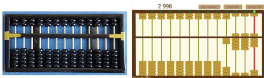
Fig. 2 The Chinese abacus, material (on the left), virtual (on the right) (Gueudet & Poisard, 2018)

classroom, because teacher design as an essential and continuous process takes place in class and out-of-class leading to associations among variables of Types C and D.