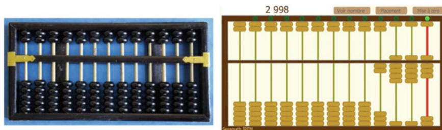
Fig. 2 The Chinese abacus, material (on the left), virtual (on the right) (Gueudet & Poisard, 2018)

classroom, because teacher design as an essential and continuous process takes place in class and out-of-class leading to associations among variables of Types C and D.