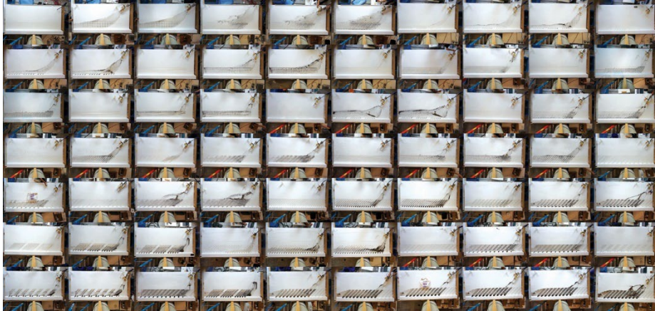
Figure 1: Still images of various roughness patterns being testing for sediment retention.