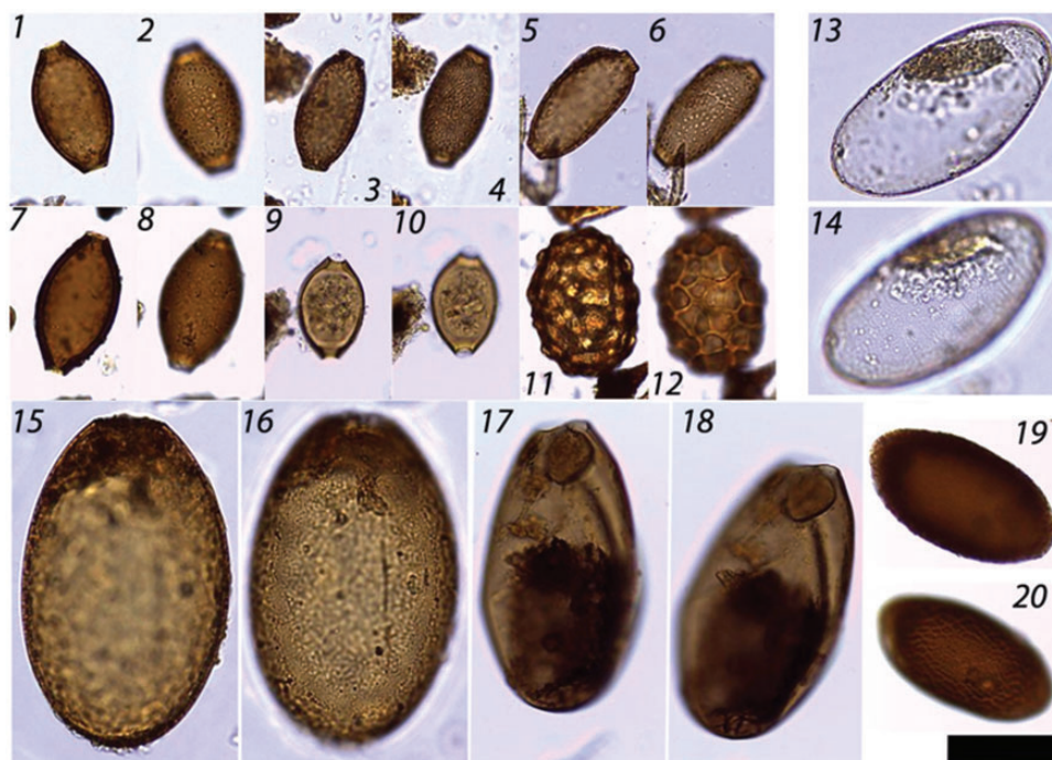
Figure 2. Microscopic eggs observed at Asi Gonia: 1 and 2 – unknown Trichocephalida; 3 and 4 – striated Capillaria sp.; 5 and 6 – punctuated Capillaria sp.; 7–10 – Trichuris sp., showing wide size variation; 11 and 12 – Ascaris sp.; 13 and 14 – strongyle-like egg; 15 and 16 – Paramphistomum sp.; 17 and 18 – Fasciola sp.; 19 and 20 – Macracanthorhynchus sp. Scale = 50 \mu m.

One egg attributable to the roundworm genus Ascaris (phylum Nematoda) was observed in the whole core (Figure 2). Ascaris sp. eggs are defined by their oval shape, consisting of an inner, smooth and thick shell, coated with a mamillated outer shell. The only observed egg from Asi Gonia measured 68 \mu m \times 51 \mu m, which falls within the known variation of this genus (50–75 \mu m \times 40–55 \mu m, according to Taylor et al., 2016). This genus is often divided into two host-specific species, namely A. lumbricoides and A. suum , respectively, infesting humans (and other primates) and pigs (wild and domestic). Meanwhile, eggs of both species are very similar and it is not possible to distinguish them from each other on the basis of morphometric traits. Moreover, the molecular similarities of both taxa may point toward a single species, namely A. lumbricoides (Leles et al., 2012), though this point is not settled yet (Søe et al., 2016). In archaeological contexts and highly anthropic places, such as ancient latrines or sewers, such a finding could reliably be interpreted as being of human origin. The case of Asi Gonia differs from this typical situation and an animal (non-human) origin of the roundworm eggs can be proposed.