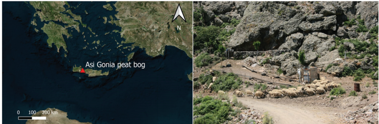
Figure 1. Location of the Asi Gonia peat bog in the Mediterranean Sea and nearby environment. Left: the Asi Gonia peat bog is situated in Western Crete, Greece. Right: sheep are reared nearby the peat bog location.

surrounding sediments. Finally, the samples were strained through a microsieving column of 315, 160, 50 and 25 \mu\text{m} meshes. Only the 50 and 25 \mu\text{m} residues were kept, as they should contain all the observable parasitic markers (i.e. the eggs), ranging from \sim 30 to \sim 160 \mu\text{m} long. After 24 h of sedimentation, the samples were ready for microscopic analysis. A total of 36 slides (22 mm \times 22 mm) were read for each sample, consisting of 18 slides from the 50 \mu\text{m} sieve, and 18 slides from the 25 \mu\text{m} sieve. Thus, a total of 792 slides were observed under the light microscope (Leica DM2000 LED). We added three surface samples consisting of two soil samples from the bog surface, and one modern sheep faeces lying on the ground near the core location. These samples were considered as control samples to test for possible contamination by modern parasite eggs.