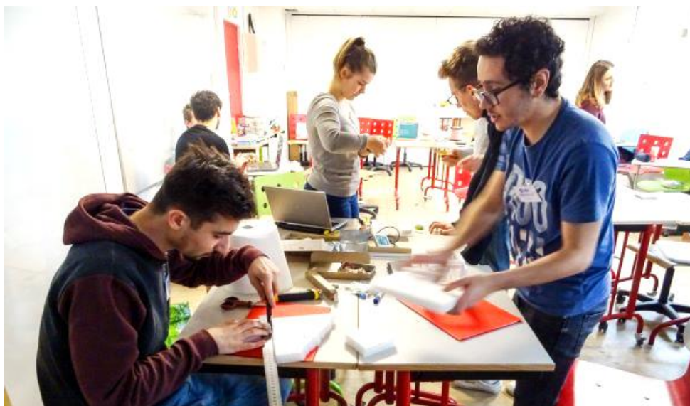
Figure 1. Students, during the immersion teaching, working on a prototype to help stranded astronauts.

The fiction closes with an end credits (often literally, with the students' names projected on a wall with music), which allows everyone to get back their own identity. A collective debriefing is then organized in order to recontextualize the teaching, to listen to the students' feedback, and to give them feedback on their work.