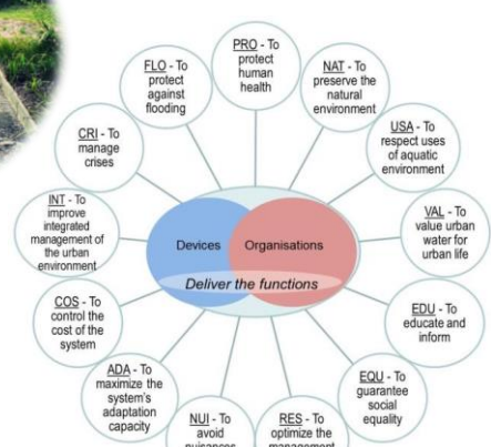
Generic representation of Sustainable Urban Water Management System functions (Belmeziti et al. , 2015)