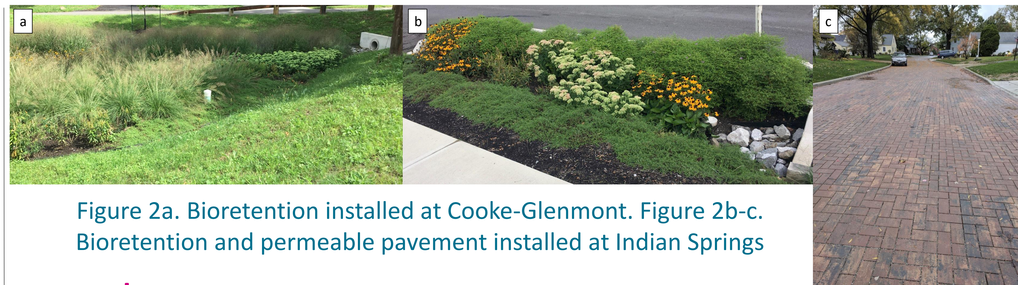
Figure 2a. Bioretention installed at Cooke-Glenmont. Figure 2b-c. Bioretention and permeable pavement installed at Indian Springs