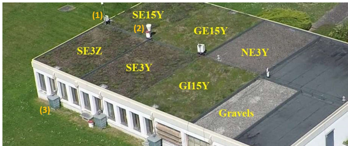
Figure 1: experimental green roof. (1): the weather station and (2): the rain gauge. The green box (3) at the foot of the building contains the tipping buckets for measuring the drainage from the gutters. The symbols are defined by G: Grass, S: Sedum, E: Extensive substrate, I: Intensive substrate, 15 cm or 3 cm for substrate thickness, Y: expanded polystyrene drainage layer, Z: pozzolan drainage layer and, N: bare substrate.

The experimental setup is an extensive green roof installed in the Cerema site at Trappes in Paris metropolitan area (France, Figure 1). The roof was divided into six 35 m 2 (7x5 m) vegetated plots which differ from four design parameters: the vegetation cover (sedum and/or grass), the substrate thickness (3 cm or 15 cm), and the nature of the substrate (intensive or extensive), as well as the type of drainage layer (expanded polystyrene or pozzolan). More details on the experimental set-up can be found in Gromaire et al. (2013). A rain gauge and tipping buckets are used to measure respectively rainfall and drainage at the gutter outlet of each plot. For each plot, sensors were used to monitor water content (EC5 and HS10 capacitive sensor, Decagon) at different depths in the substrate. The data set was acquired at a 1-minute time step over a period of several years from July 2011 to July 2018.