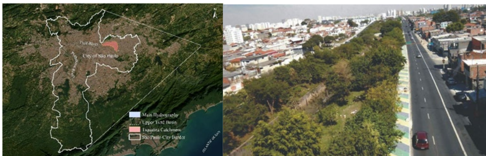
Figure 1 - Localization of Tiquatira catchment and current view of the study site

This paper presents the case study of these two reservoirs and the flood resilient park in the Tiquatira Catchment, located in the urban area of São Paulo, considering its interference with the urban landscape. Aside from the conventional concrete reservoir, it aims to present and analyze a more sustainable approach with their implementation.