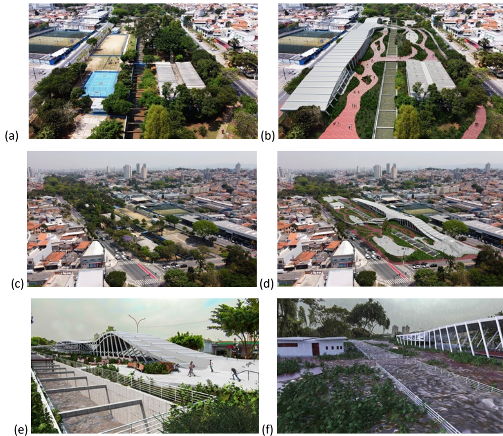
Figure 3 - Perspective illustrations on (a) current site configuration; (b) future site configuration; (c) Current site overview; (d) future site overview; (e) dry view of the proposition; (f) flood view of the proposition

The next images presented in Figure 2 present the before and after of the interventions and also a dry and wet expected result.