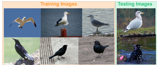
Figure 1: Background bias in fine-grained classification

The context in which an object is found is known to have a large influence in how it is perceived, both by humans [3] and machines [7]. When training deep learning-based computer vision models on any object-centric task, it is extremely challenging to ensure that the model does indeed only pay attention to the object of interest, since there exist often strong correlations between object characteristics and the background. Such a bias can lead to degraded