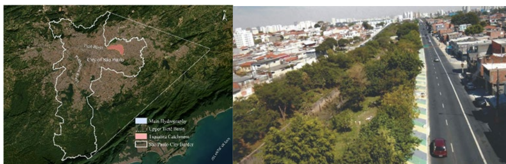
Figure 1 - Localization of Tiquatira catchment and current view of the study site

This paper presents the case study of these two reservoirs and the flood resilient park in the Tiquatira Catchment, located in the urban area of São Paulo, considering its interference with the urban landscape. Aside from the conventional concrete reservoir, it aims to present and analyze a more sustainable approach with their implementation.