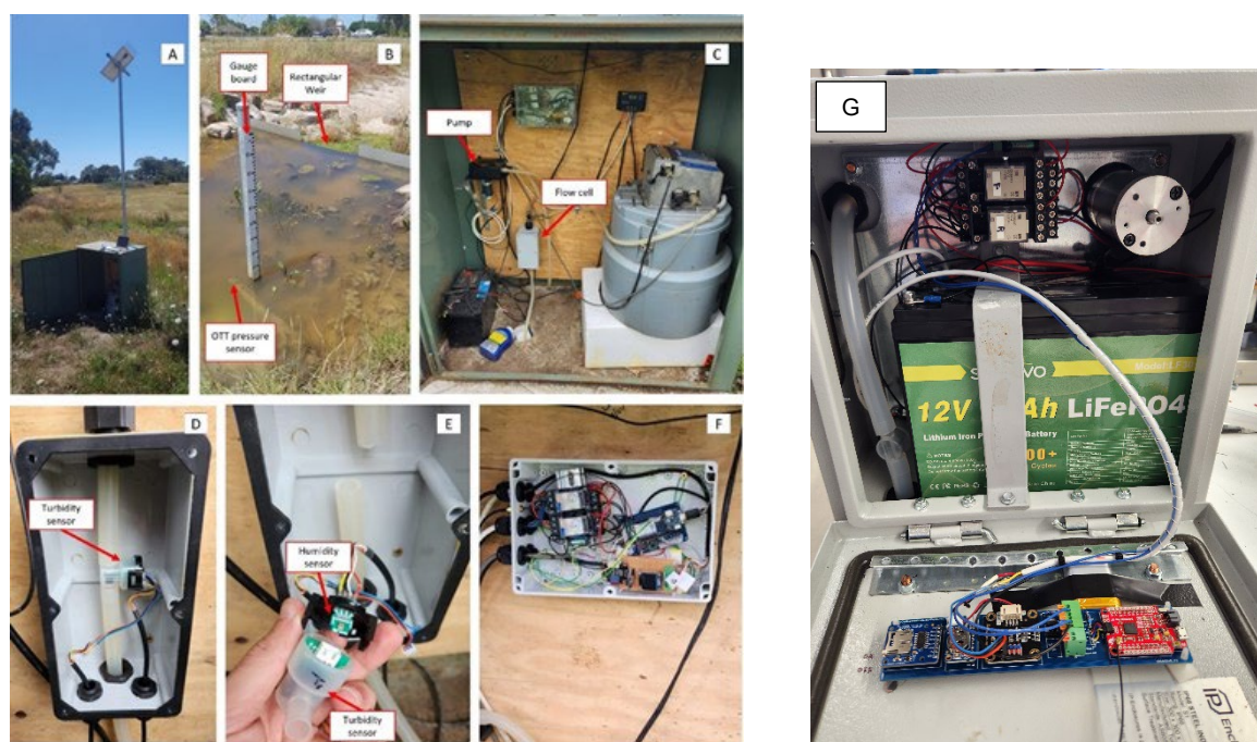
Figure 3 - Monitoring Station (ORD0003) (on the left), and mobile turbidity sensor unit (on the right). A) cabinet e solar panel; B) gauge board, OTT pressure sensor and weir; C) charge regulator, battery, autosampler, flow cell and pump; D) turbidity sensor (TST-10) in the flow cell; E) Humidity sensor and turbidity sensor within the sensor housing; F) Arduino board (logger and control system); G) mobile turbidity sensor unit.

that were used during the lab experiments.