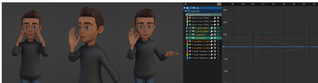
Figure 1: Example results for the AZee expression presented. the first two poses are snapshots of TOPIC and INFO , while the following represent the intermediate pose and the evaluated motion curves

Michael Filhol michael.filhol@cnrs.fr CNRS, Université Paris Saclay Orsay, France