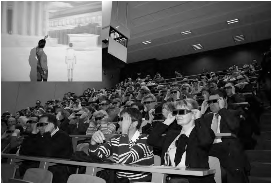
FIGURE 2 : A VISIT WITH AN ACADEMIC GUIDE.