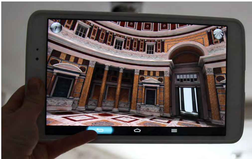
FIGURE 4 : THE APPLICATION 'PANTHEON'.