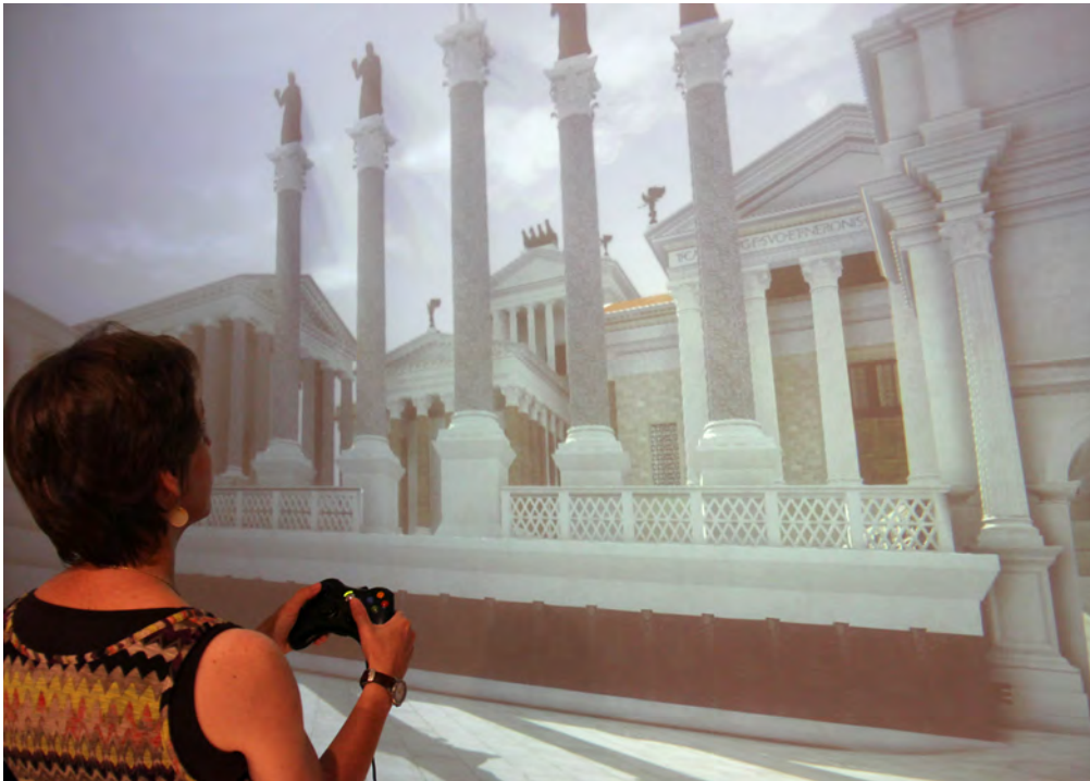
FIGURE 3 : A SELF SERVICE VISIT.