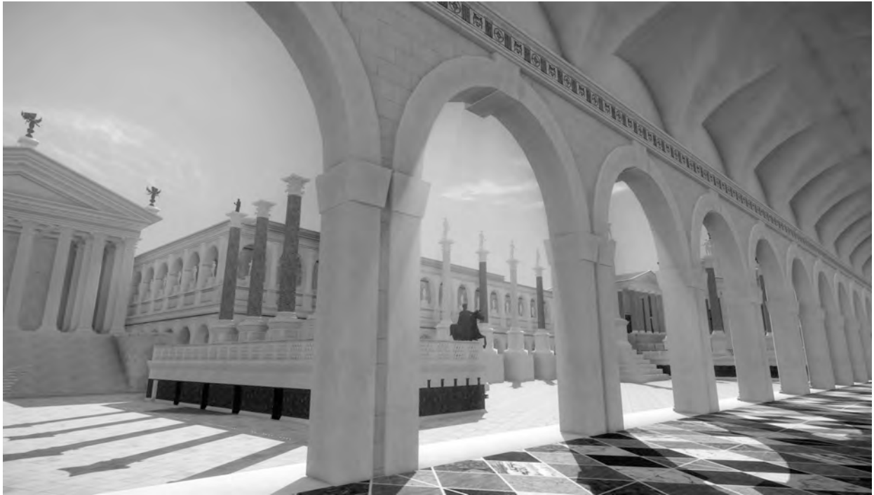
FIGURE 1 : THE FORUM ROMANUM.