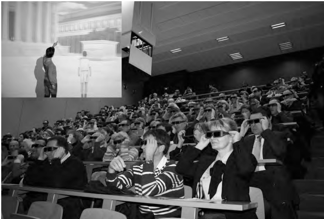
FIGURE 2 : A VISIT WITH AN ACADEMIC GUIDE.