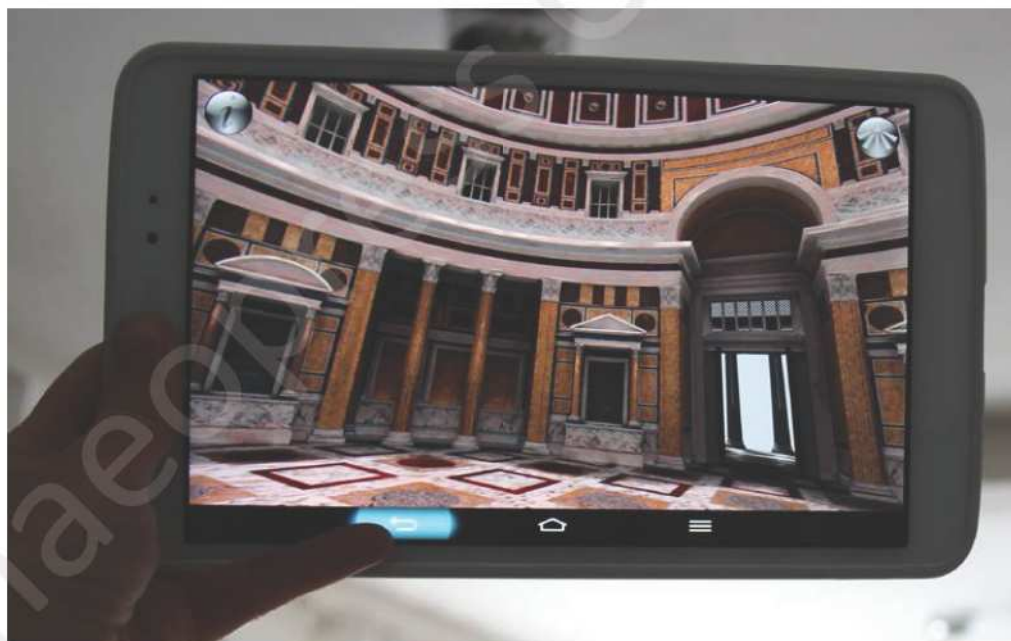
FIGURE 4 : THE APPLICATION 'PANTHEON'.