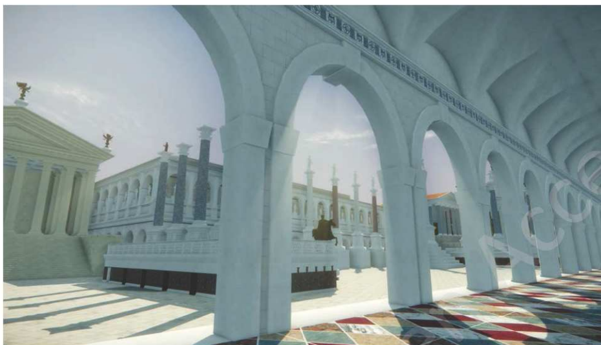
FIGURE 1 : THE FORUM ROMANUM.