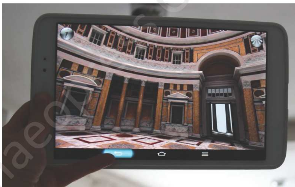
FIGURE 4 : THE APPLICATION 'PANTHEON'.