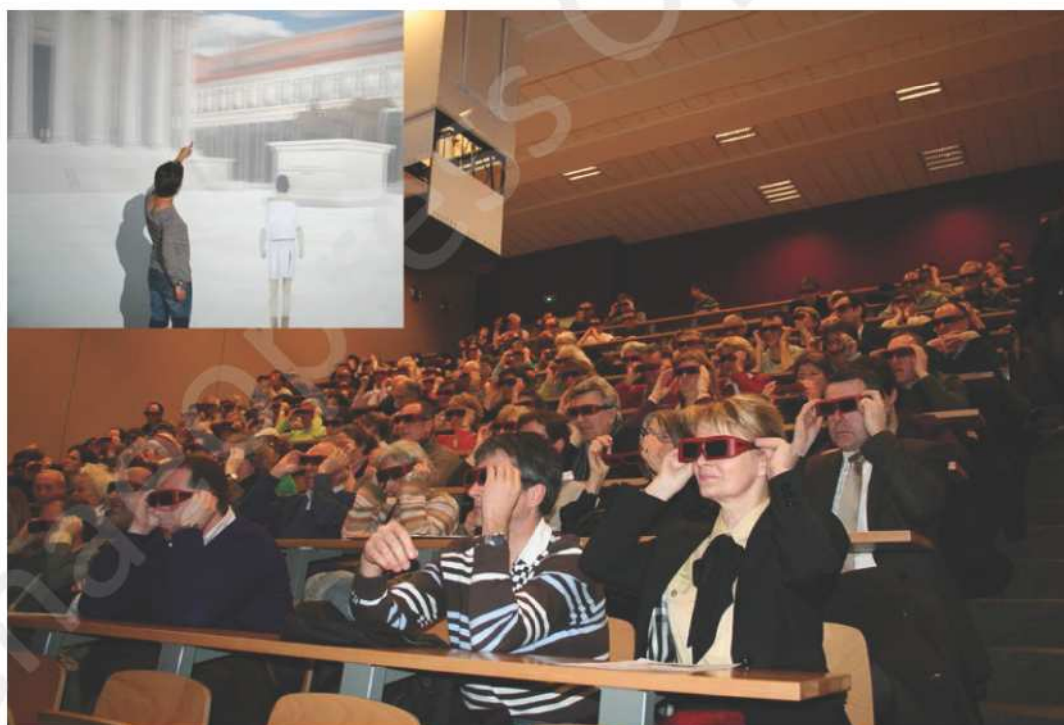
FIGURE 2 : A VISIT WITH AN ACADEMIC GUIDE.