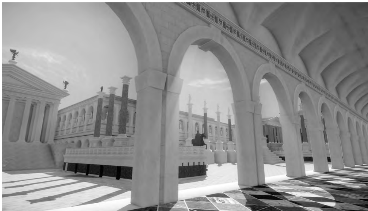
FIGURE 1 : THE FORUM ROMANUM.