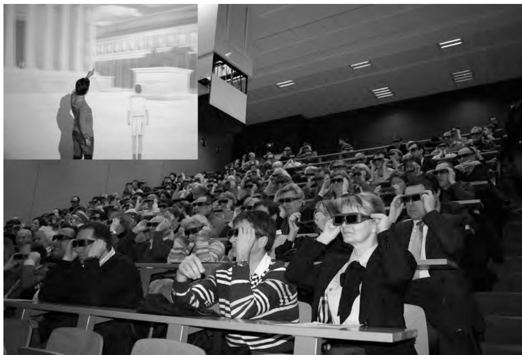
FIGURE 2 : A VISIT WITH AN ACADEMIC GUIDE.