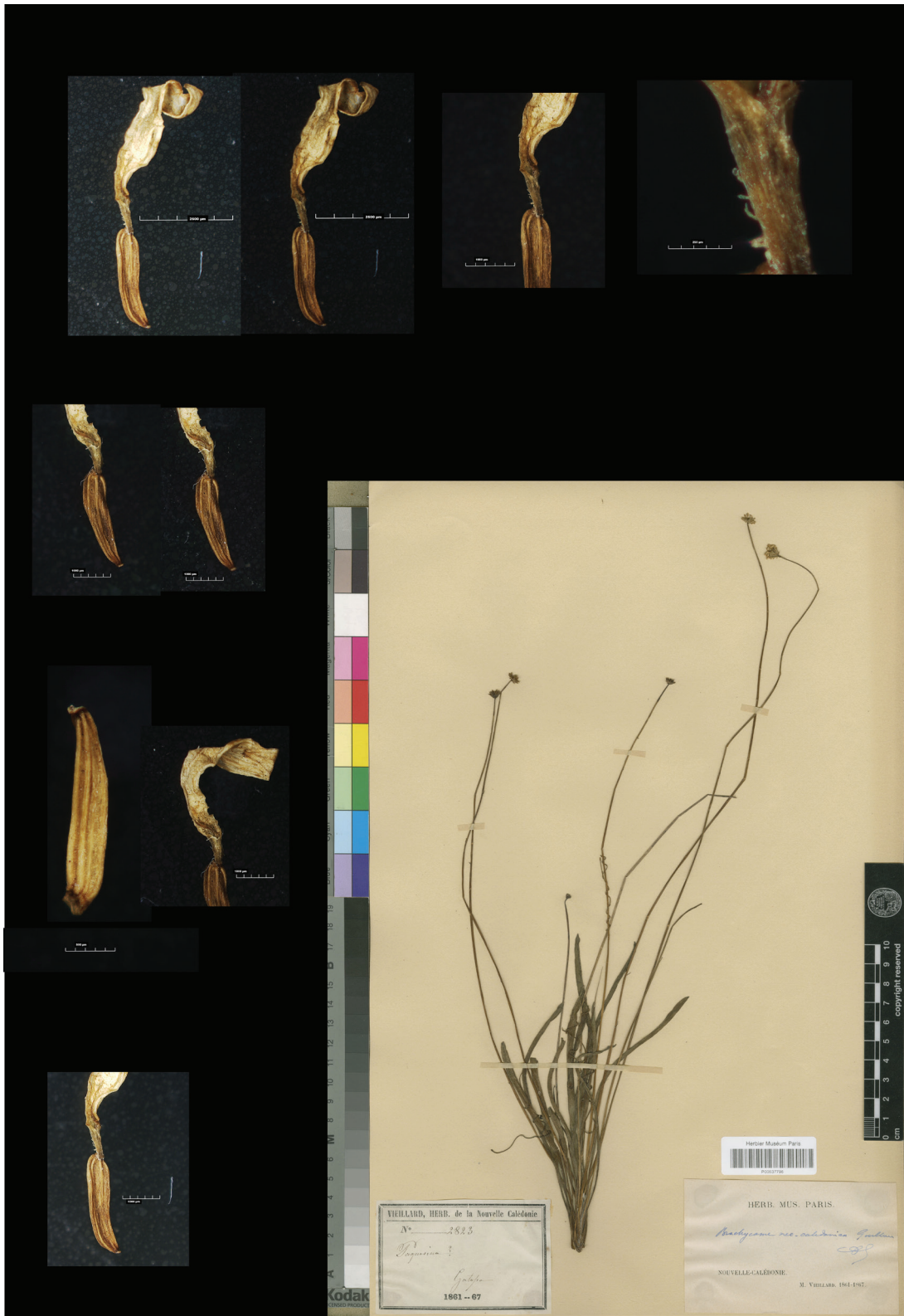
Fig. 3. Vieillard 2823 – P00537796, with detailed images of the ray florets and cypselae