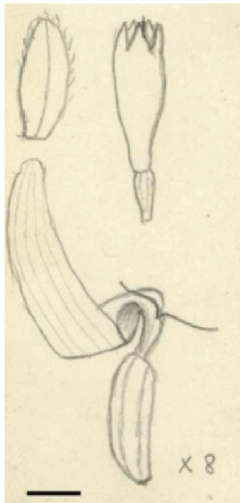
Fig. 2. Guillaumin's drawing on P00537795, Mus. Néocal. [Pancher] 94 [Vieillard 2823]