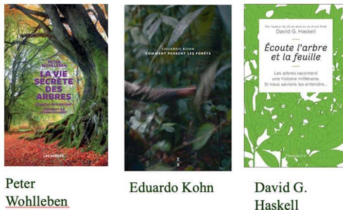
Fig 2: major bestsellers books published in France in 2017

2017 publications clearly mark a turning point: collections are opening up, the world of plants is decoded from a multitude of different angles, bestsellers are published (the works of Peter Wohlleben or Francis Hallé in France). This same year 2017 introduces another perception of nature and of the relationship with living beings: books such as " La vie secrète des arbres " (The secret life of trees, Wohlleben, 2017), " Écoute l'arbre et la feuille " (French translation of the book: " The Songs of Trees: Stories from Nature's Great Connectors ", Haskell, 2017), " Comment pensent les forêts " (2017, translation of the book: Kohn, E. (2013), How forests think: Toward an anthropology beyond the human , Univ. of California Press, 2013), or the issue of the popular science journal Sciences et vie (December 2017) mark a significant change.