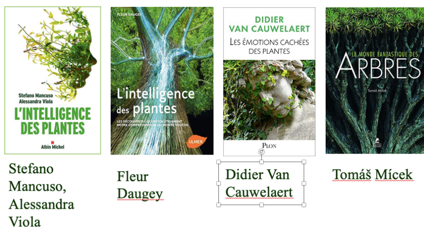
Fig 3: major bestsellers books published in France in 2018

parts of the world (cf. Wohlleben's book 2 ). These works open the way to many other publishers, who will release in the following years other works on plants, gardens and forests. 2018 is in line with 2017, with many books digging the furrow of the intelligence of plants and their sensitivity: “ L’intelligence des plantes ” (The intelligence of plants, Mancuso & Viola, 2018) ; “ L’intelligence des plantes ” (Daugey, 2018); “ La vie secrète des plantes ”, Tomkins & Bird, 2018 3 ; “ Les émotions cachées des plantes ” (The hidden emotions of plants, Van Cauwelaert & Clerc 2018); “ Le langage secret des arbres ” (The secret language of trees, Thoma, 2018); “ Le monde fantastique des arbres ” (The fantastic world of trees, Mizcek, 2018); “ Penser comme un arbre ” (think like a tree, Tassin, 2018); “ La plante et ses sens ” (The plant and its senses, Chamowitz, 2018).