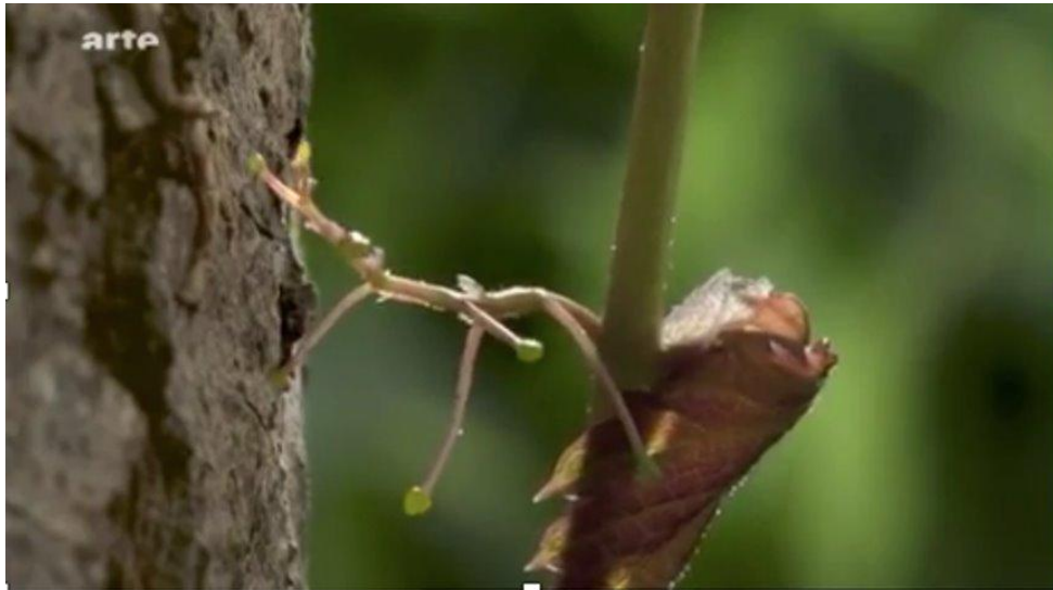
fig. 3. A still from the documentary "L'intelligence des arbres".

improvement of their position on the ladder of the living inherited from the past) is that apparently they don't move, and this absence of movement makes them nearer to non-living beings. So, it is not surprising that acceleration of plant movements is used in documentaries like "L'intelligence des plantes" and "Le murmure de la forêt. Quand les arbres parlent". In the first one, for example, the growth of an ivy on a trunk is accelerated, and the result is a sort of zoomorphic visual transformation (fig. 3).