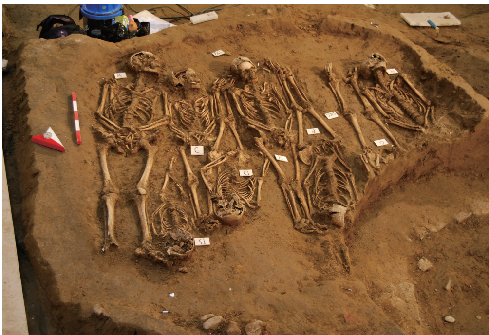
Fig. 1. Pit grave T9 (Uffizi Gallery, Florence) containing 8 aligned individuals deposited simultaneously. The bodies were closely joined, with alternating orientation and diversified position of the upper limbs.